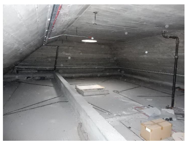
Roof Void showing Plantroom location