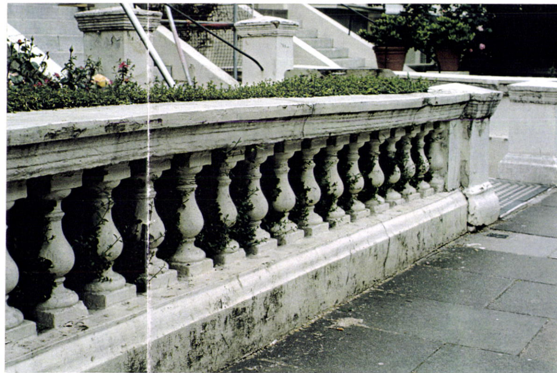
Balustrade examples existing in Belsize Park