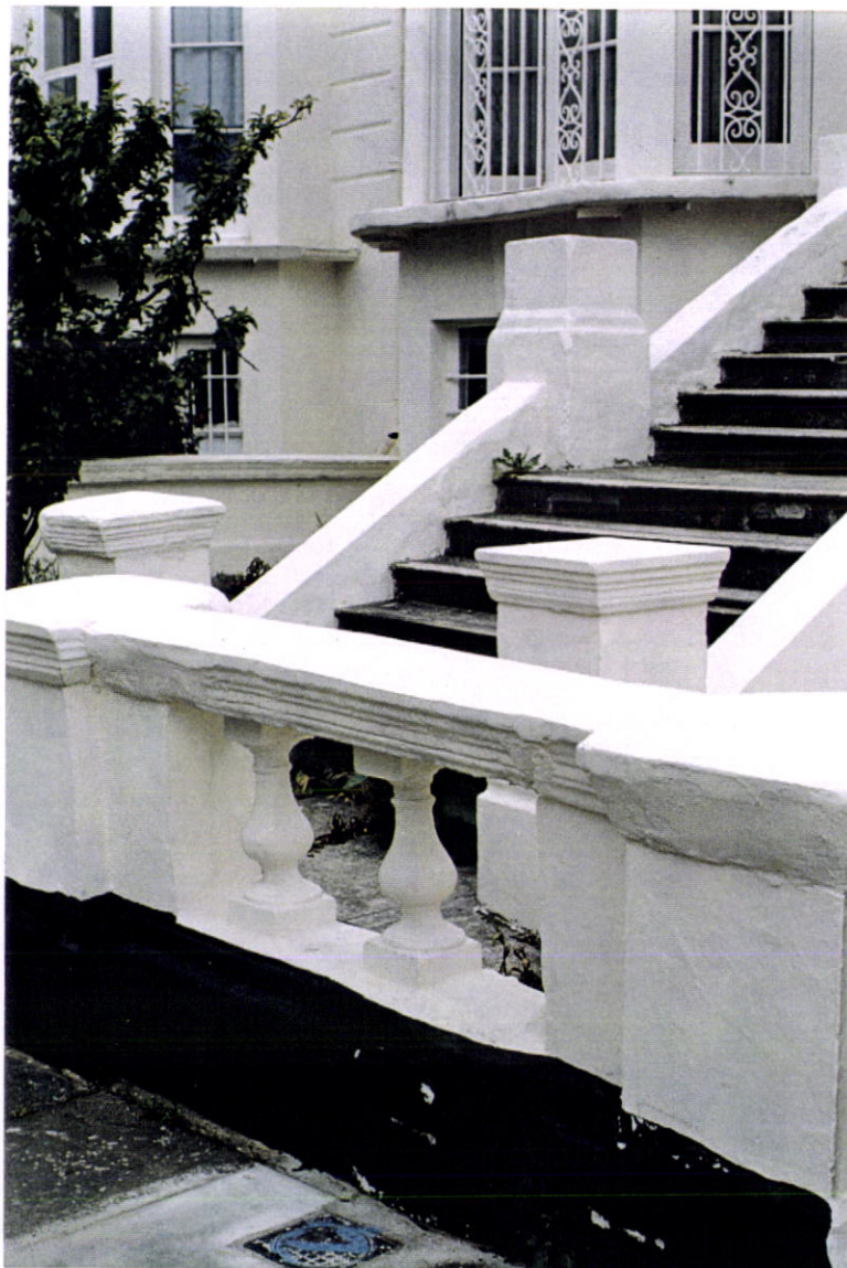
Existing balustrading to 42 Belsize park.

We have decided to use rounded balusters in our project, as shown in drawing 380-07. We believe that these are most suitable for the scheme.