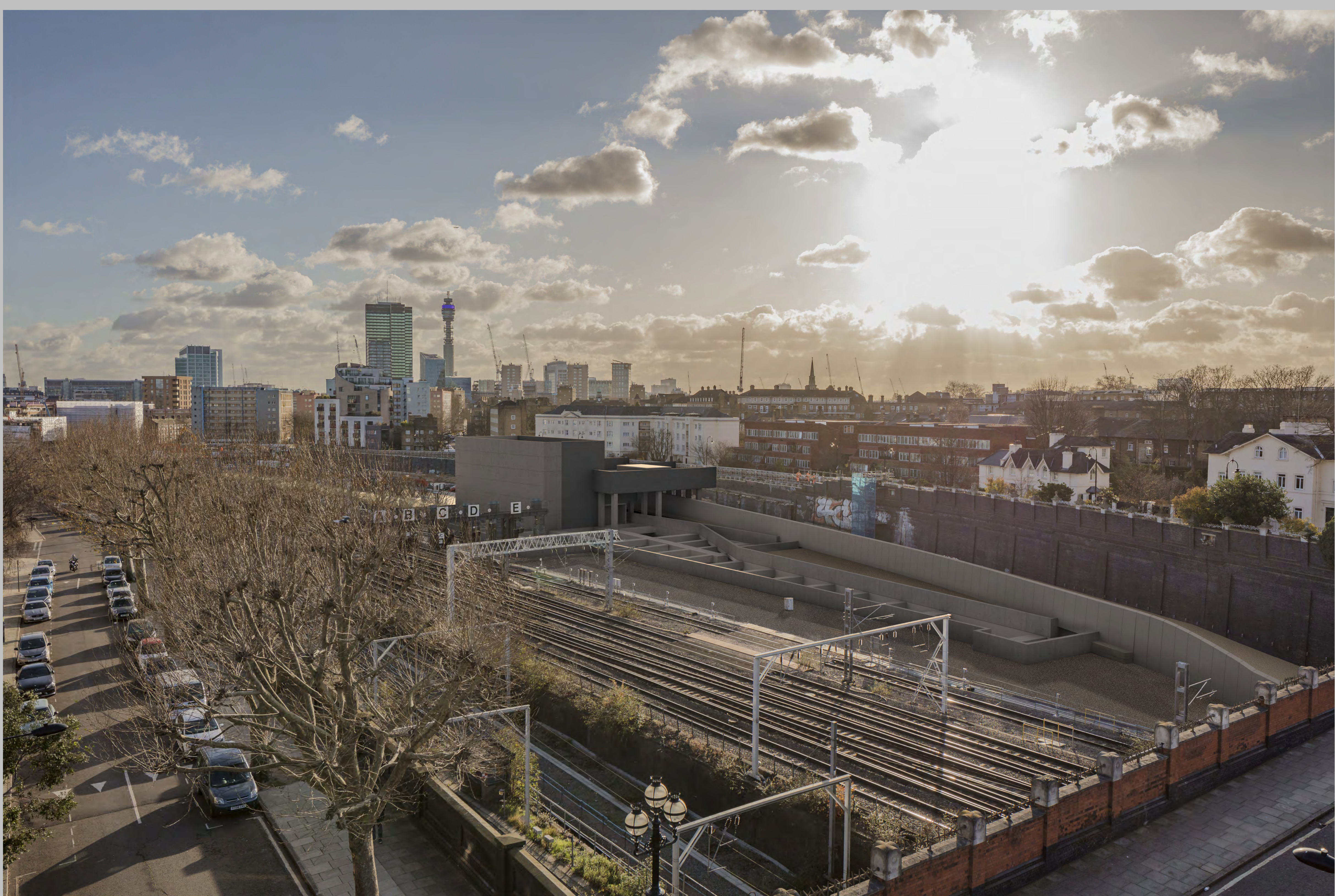
View B2 from Mornington Terrace to the West -Year 1 Operation Proposed