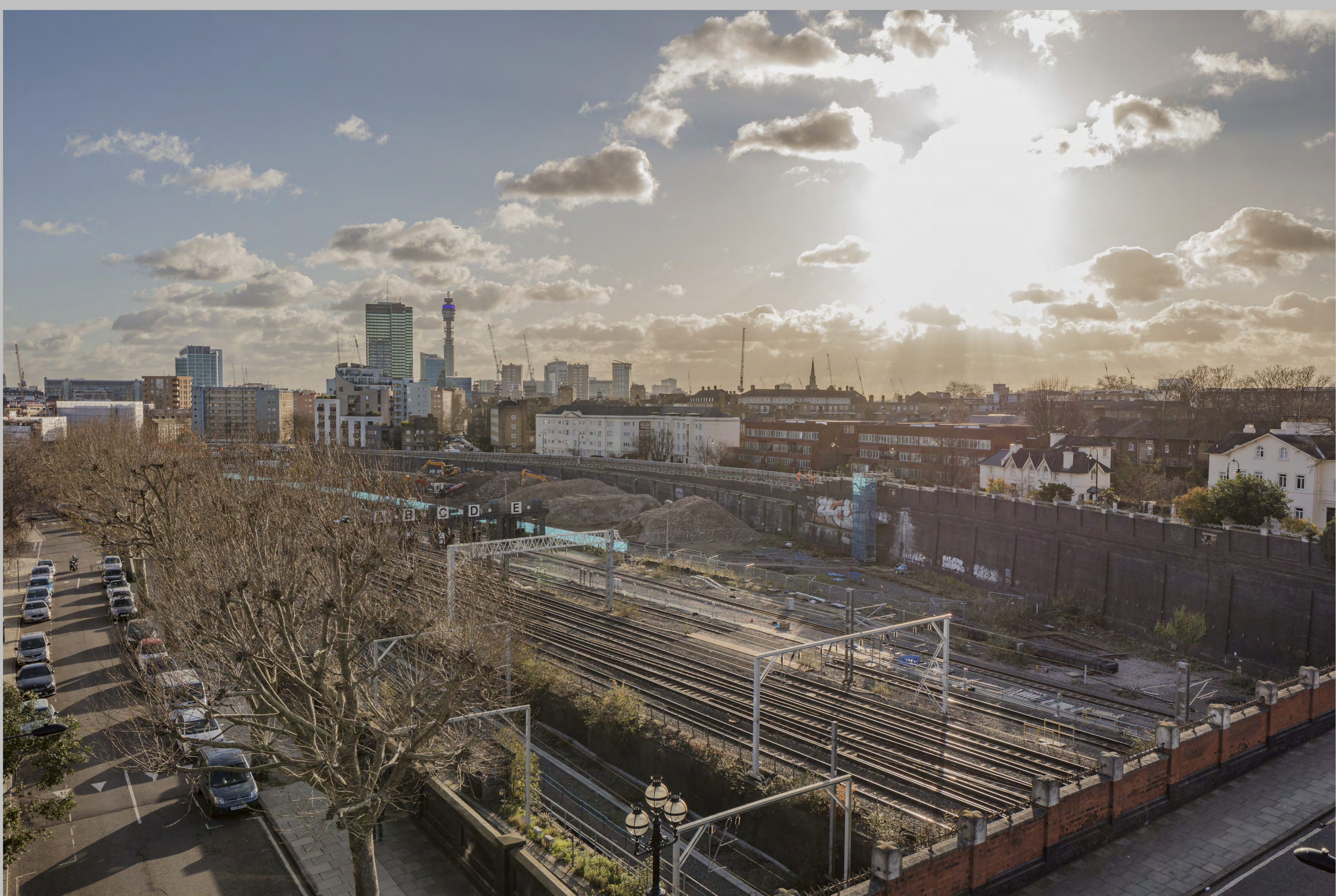
View B2 from Mornington Terrace to the South - Existing