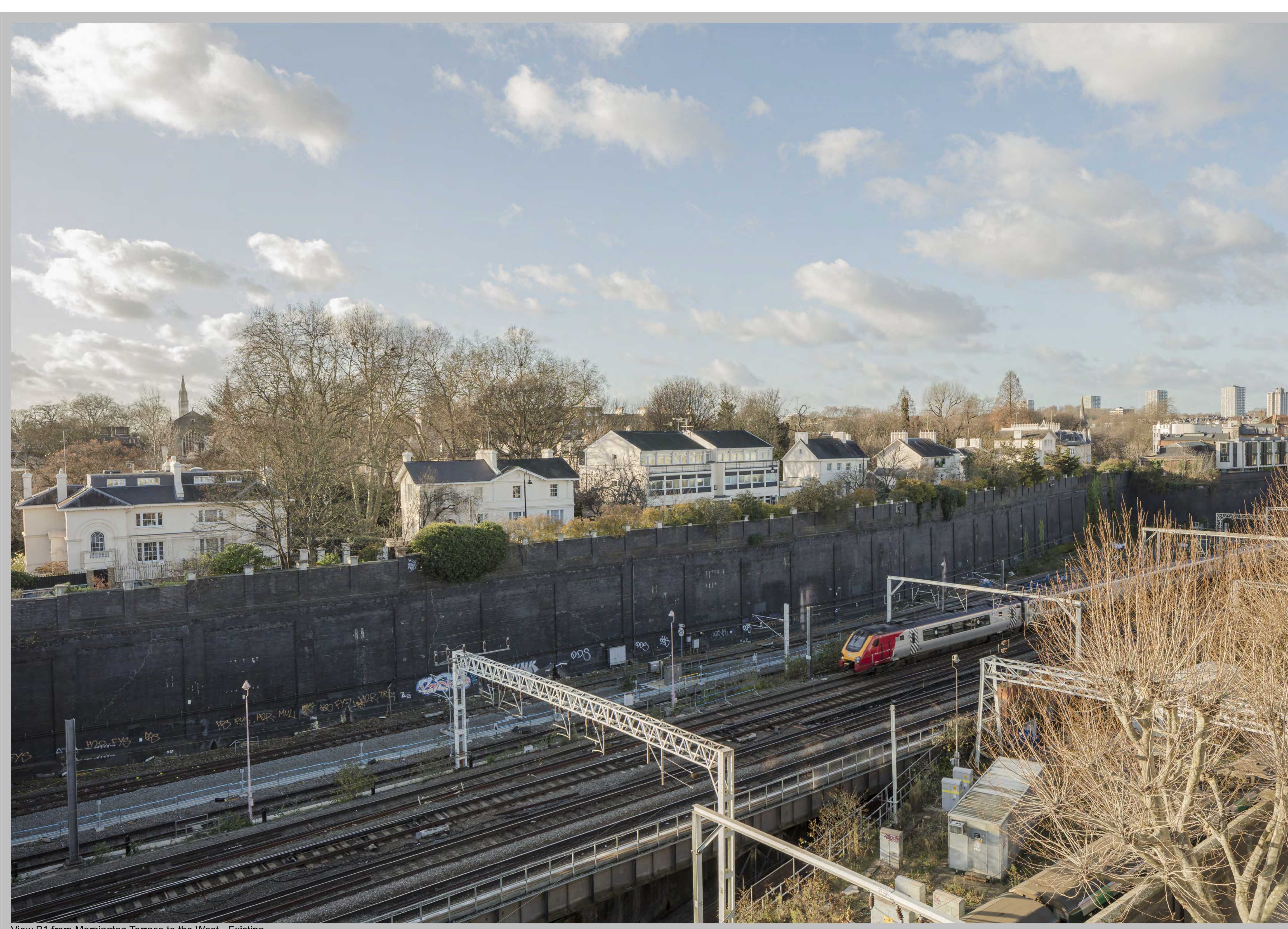
View B1 from Mornington Terrace to the West - Existing