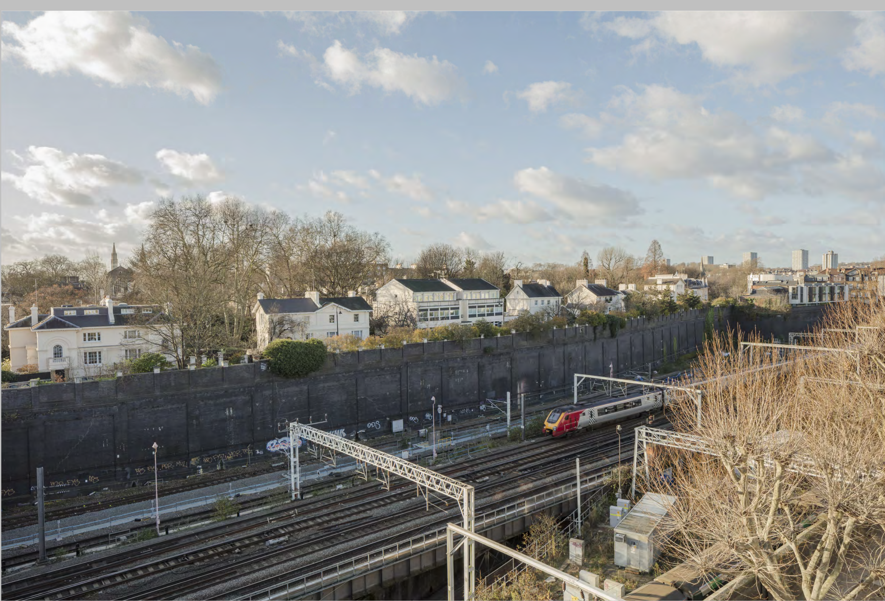
View B1 from Morningson Terrace to the West - Existing