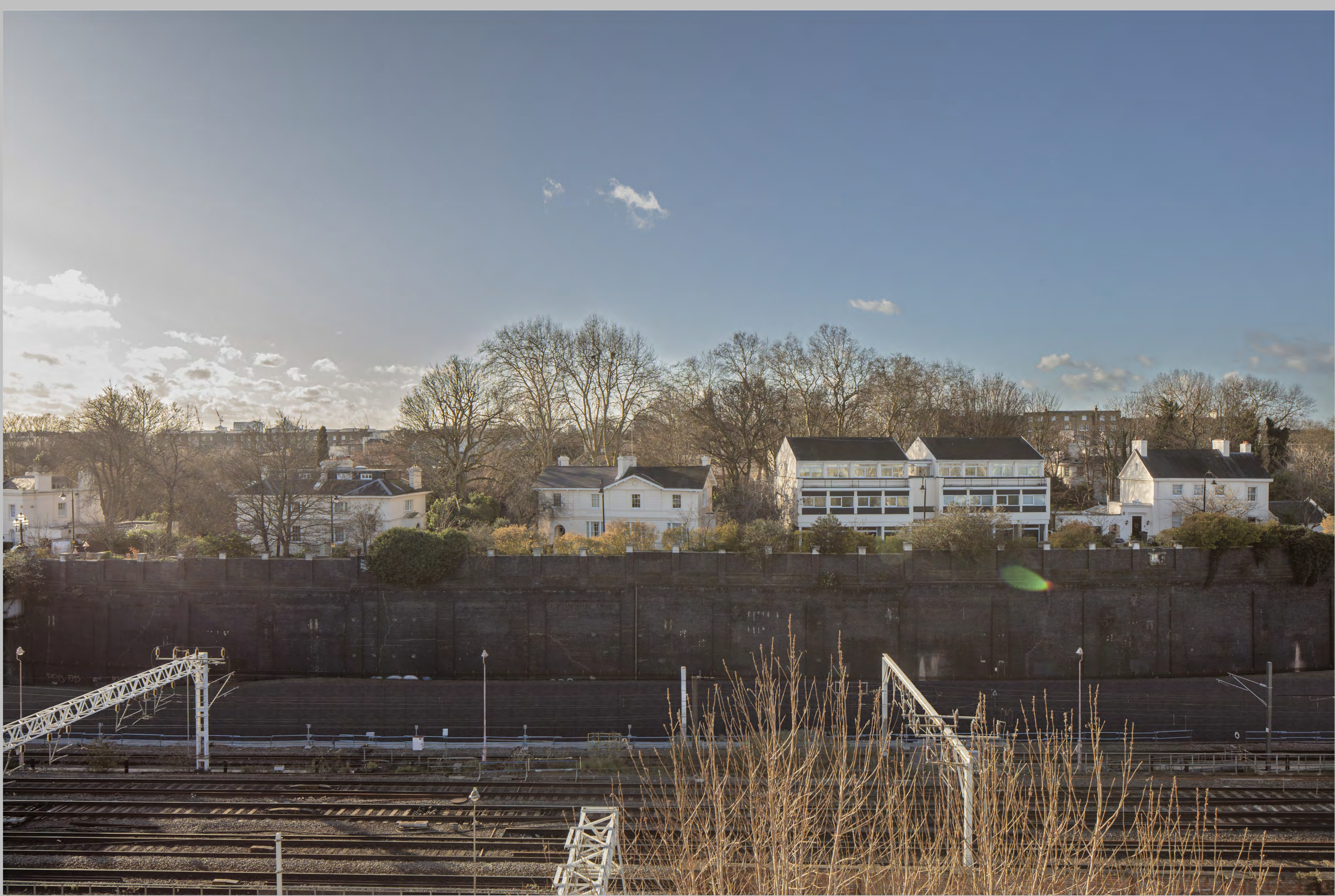
View A1 from Mornington Terrace to the South-West - Year 1 Operation Proposed