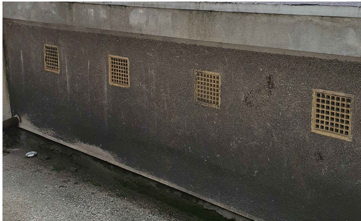
Existing Air Bricks