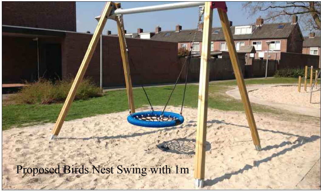
Proposed Birds Nest Swing with 1m