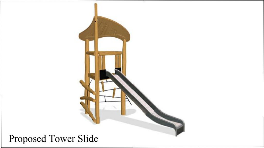
Proposed Tower Slide

Images of proposed play equipment, as supplied by kompan or similar