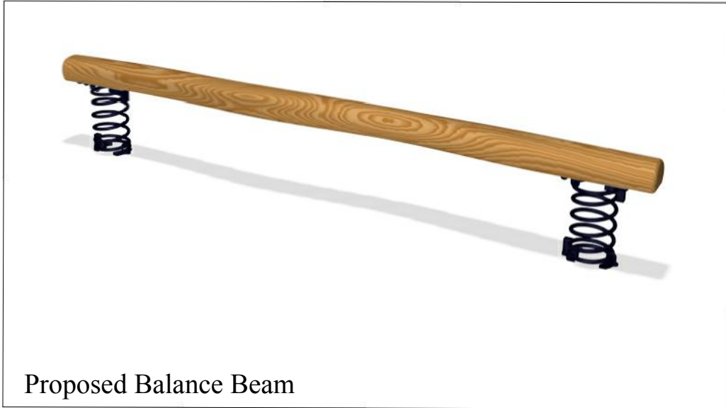
Proposed Balance Beam