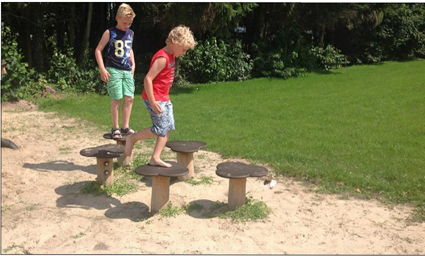
Proposed Waterlilies stepping stone, balancing play feature to be set within pebble feature