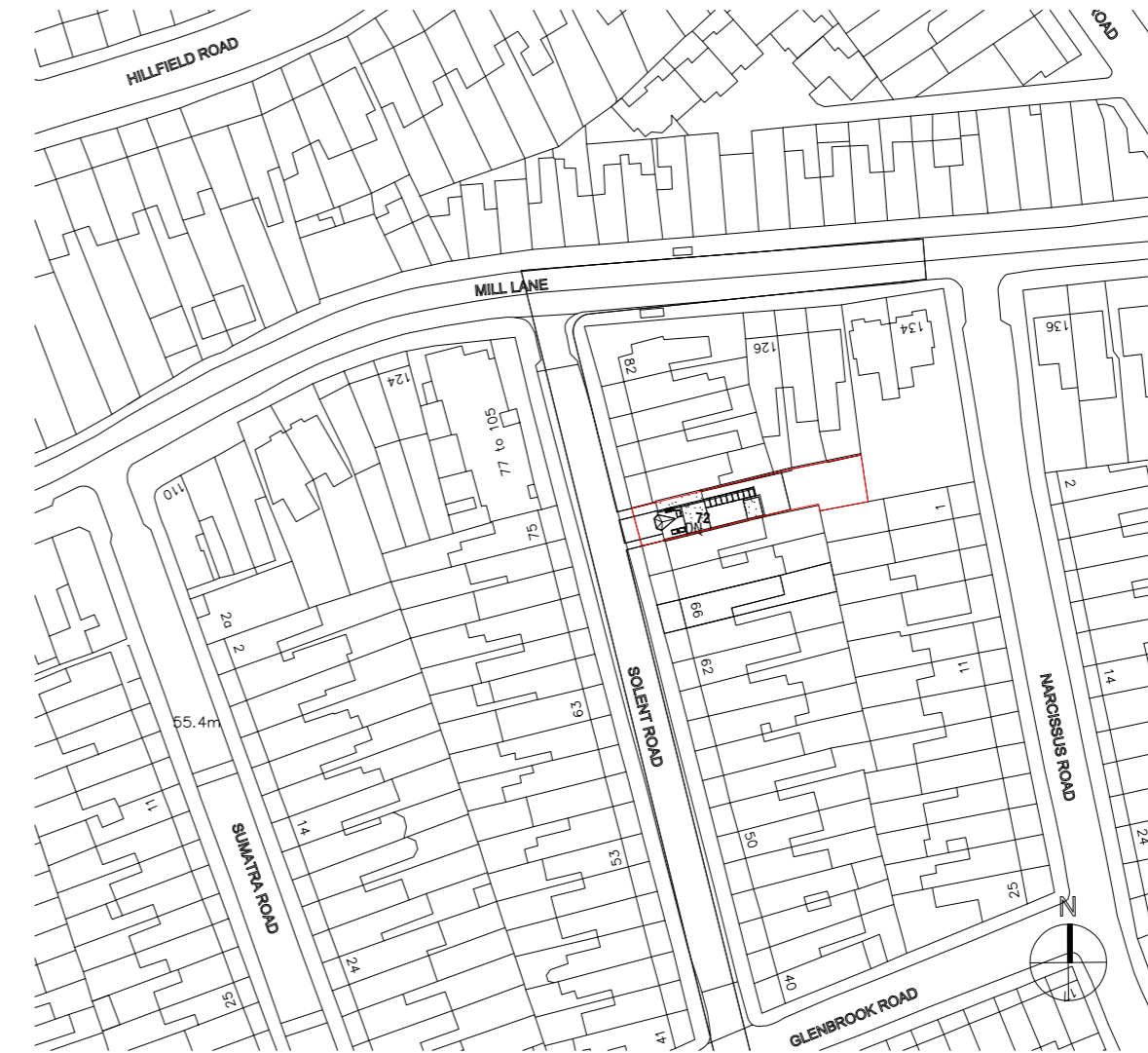
2 Location Plan 1 : 1250