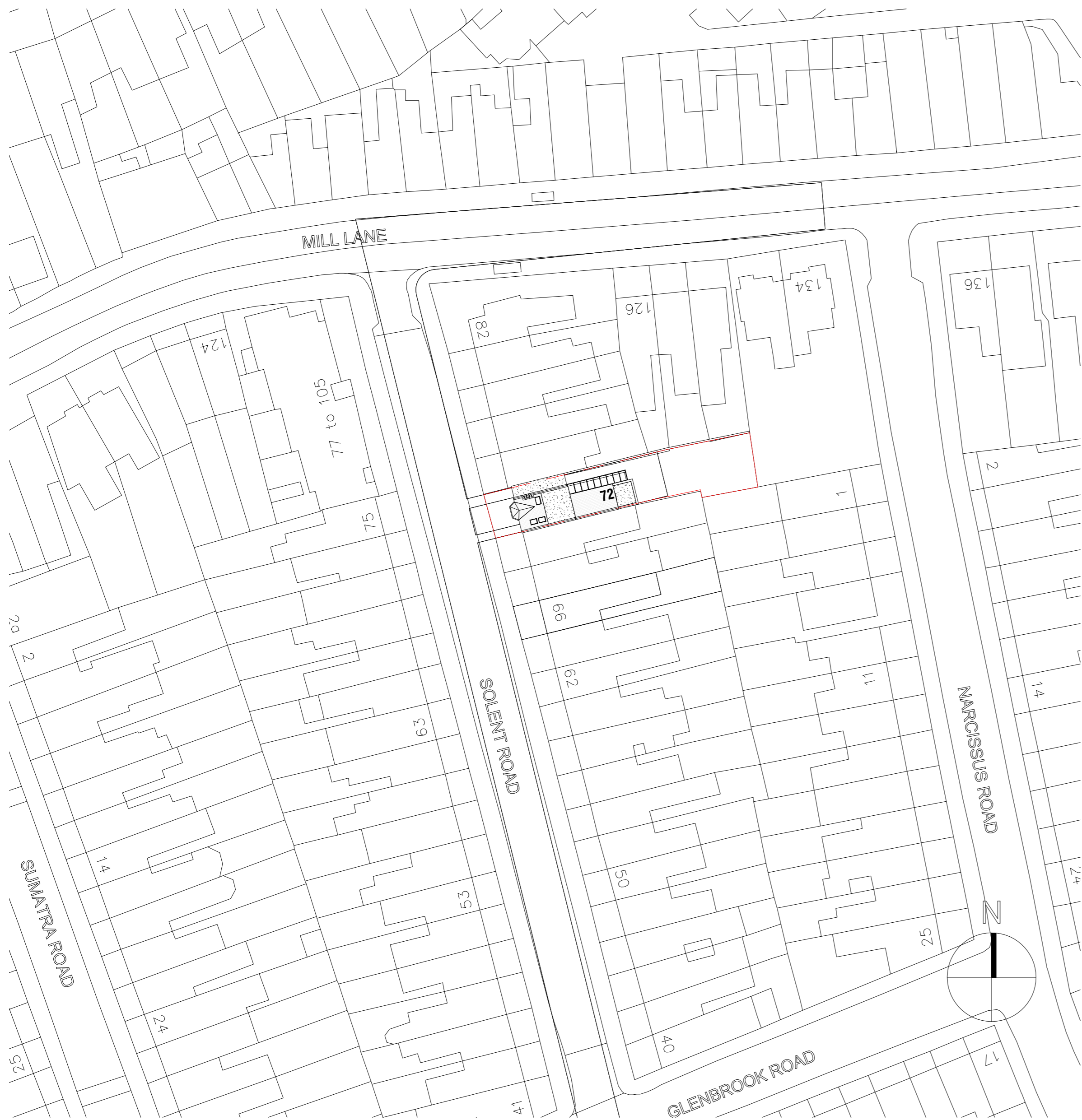
1 Block Plan 1 : 500