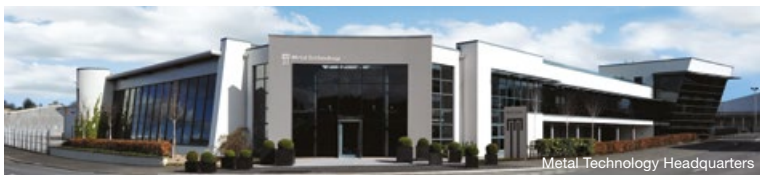
Metal Technology Headquarters

This document has been printed on 100% recycled paper.