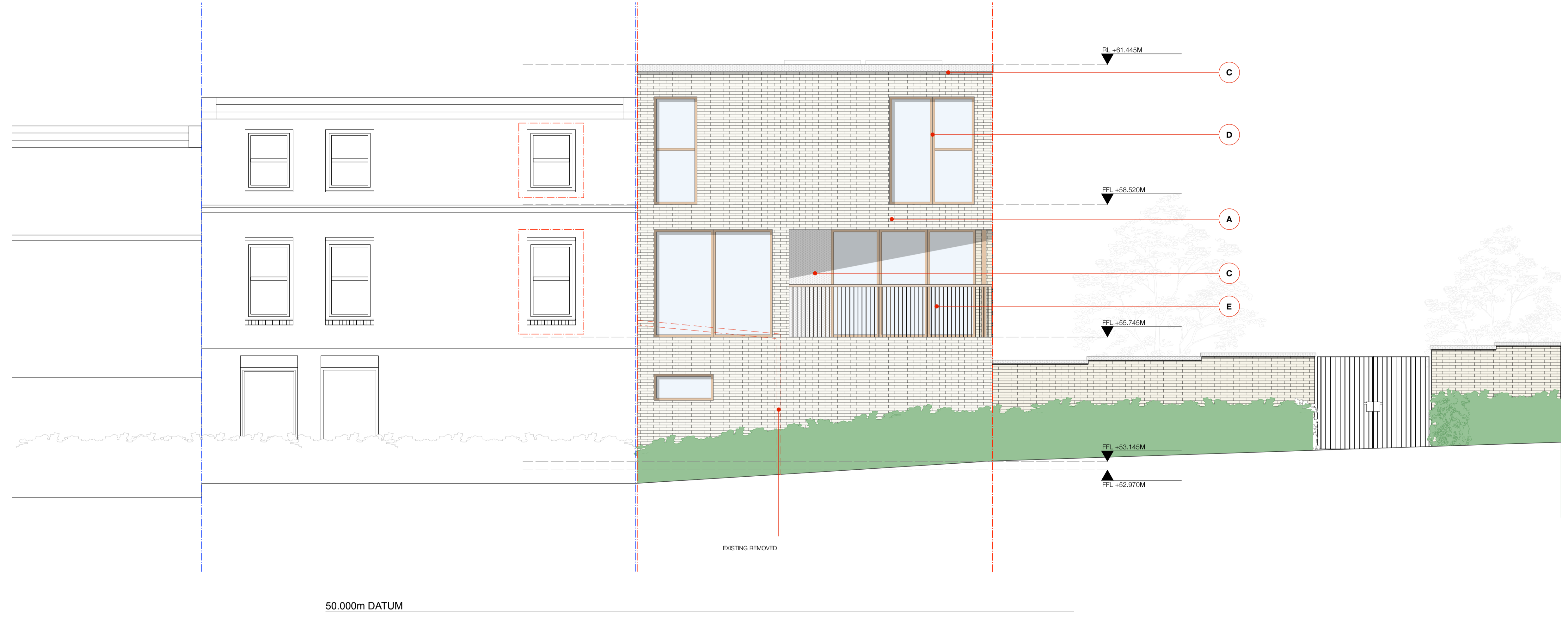
SOUTH EAST ELEVATION SCALE 1:50 @ A1 / 1:100 @ A3

KEY: - - - SITE OWNERSHIP - - - RESIDENTIAL CURTILAGE - - - EXISTING TO BE REMOVED