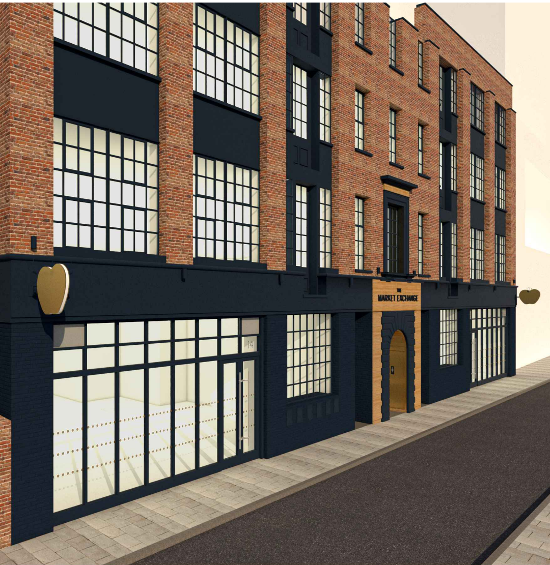
Design Intent - Proposed location and design for new signage