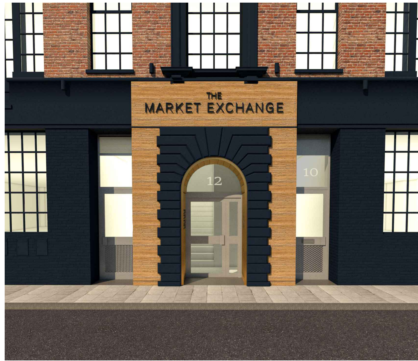
Design Intent - Proposed location and design for new signage

Proposed new linear LED light. Light fitting casing to be PPC RAL 5011. Light to be on a timer, LED strip light to be circa 600lm/m. New PPC metal central lettering, RAL 5011. Hidden fixings. Detail as per signage sub-contractor.