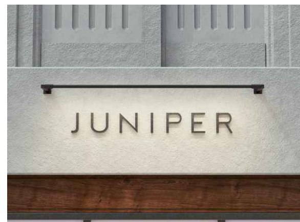
Example of the metal lettering

New PPC metal central lettering, RAL 5011. Hidden fixings. Detail as per signage sub-contractor.