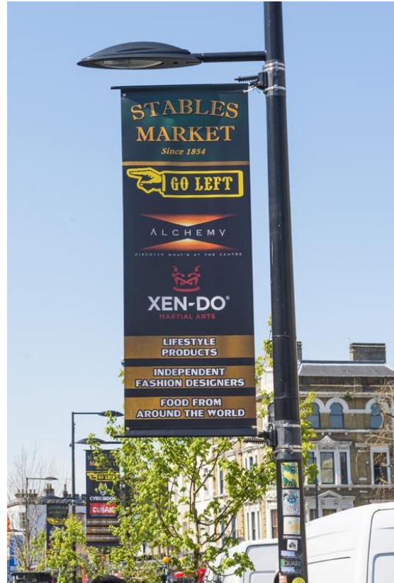
Stables Market – Chalk Farm