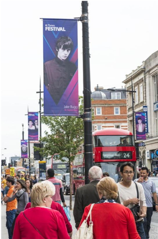
iTunes – Camden High Street

“Contract for the grant of media-ownership of non-illuminated commercial advertising on lampposts” -2011