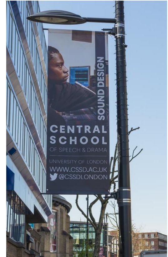
CSSD – Chalk Farm