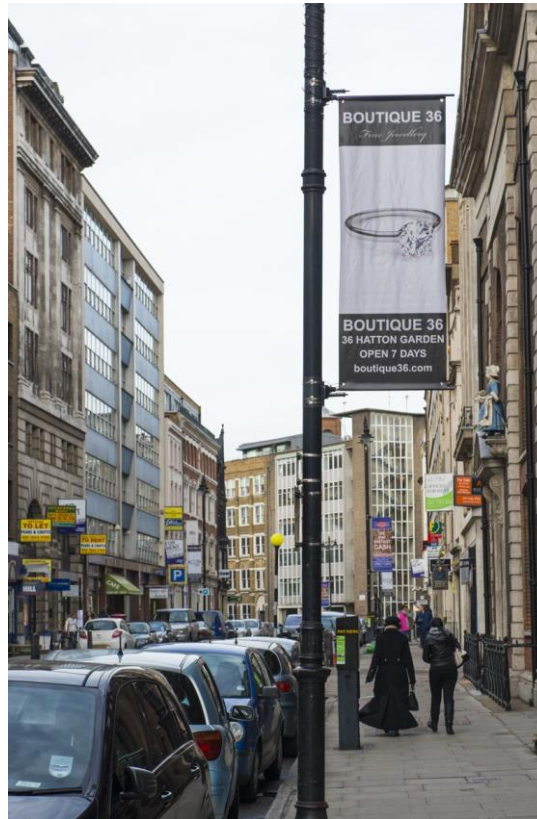
Boutique 36 – Hatton Garden