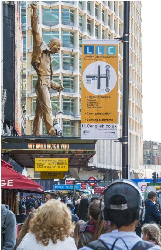
Learning Centre – Tott Court Road

“Contract for the grant of media-ownership of non-illuminated commercial advertising on lampposts” -2011