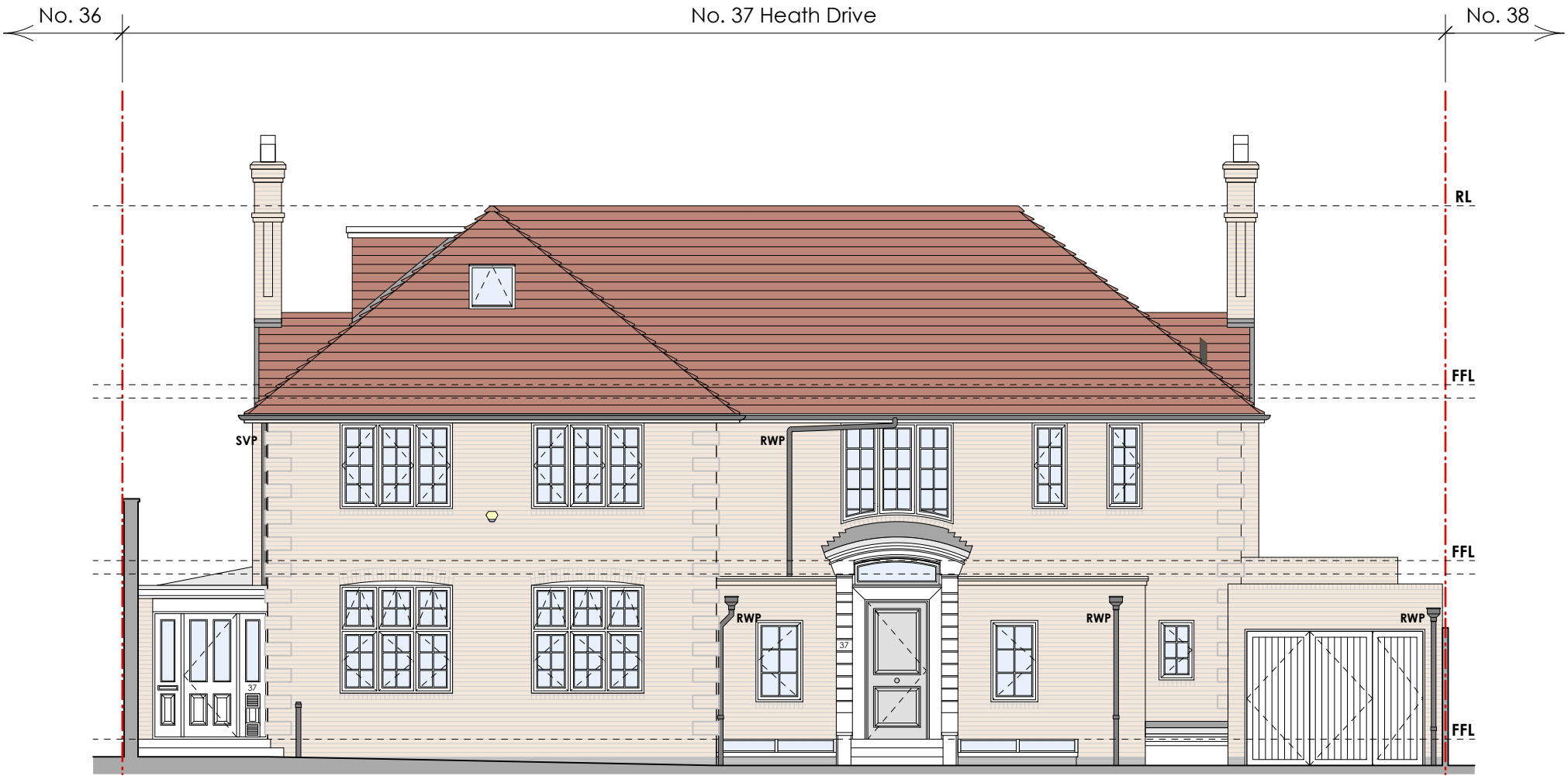
1 Existing Front Elevation scale: 1:100 @ A3