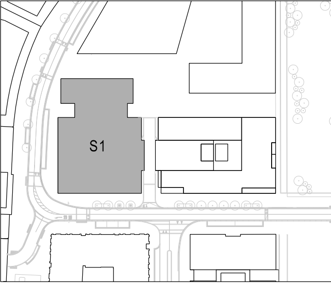
KEY PLAN N