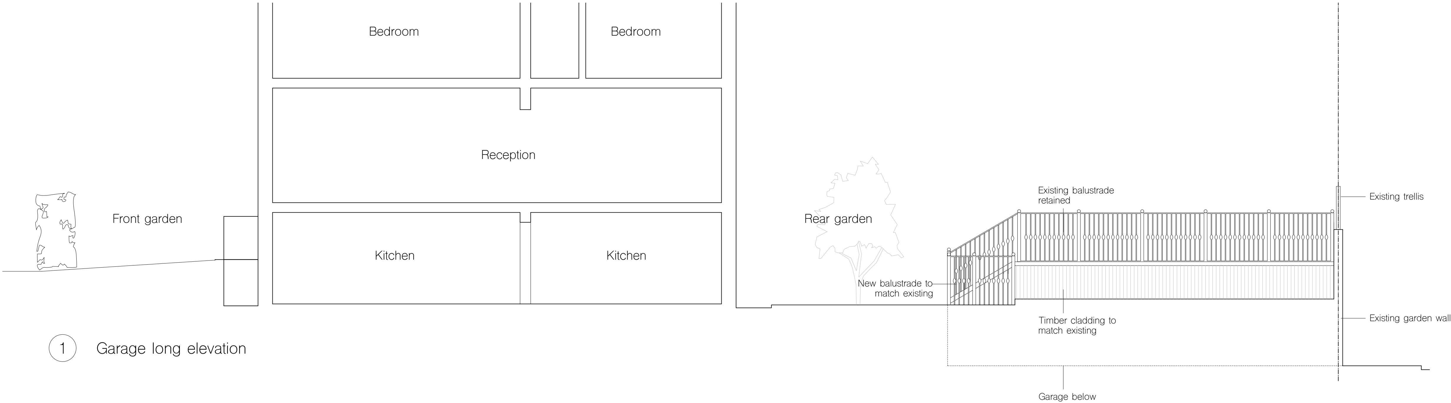
1 Garage long elevation