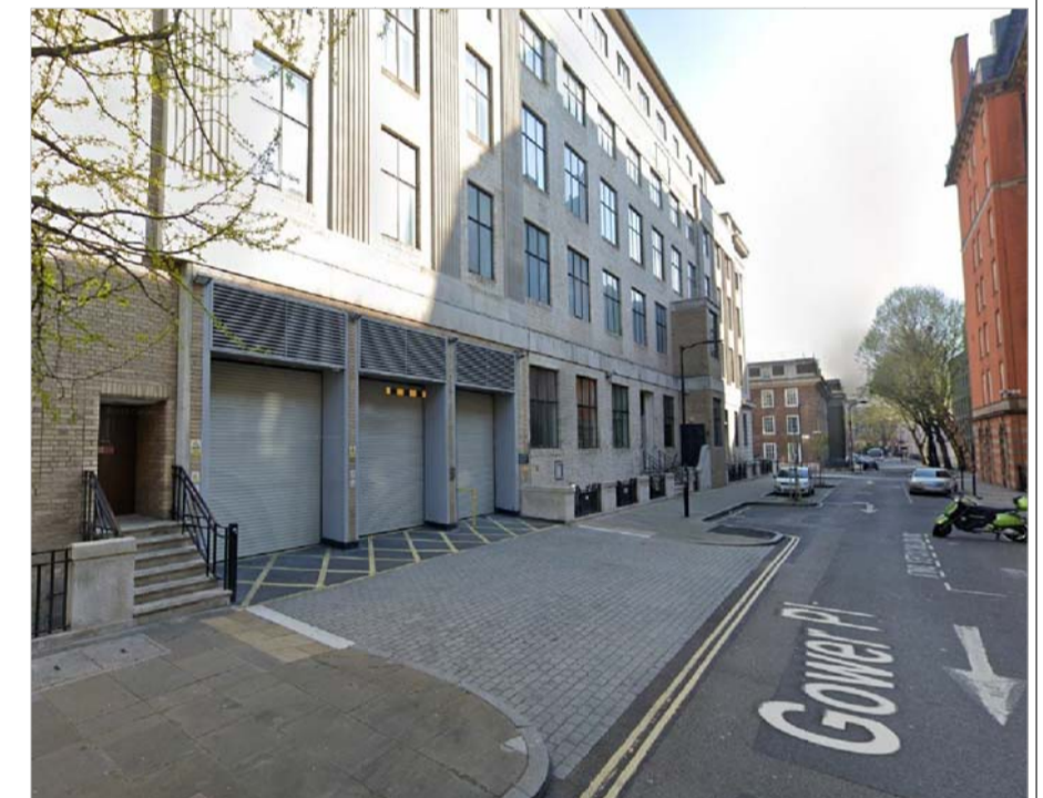
Streetview of existing loading bay entrance