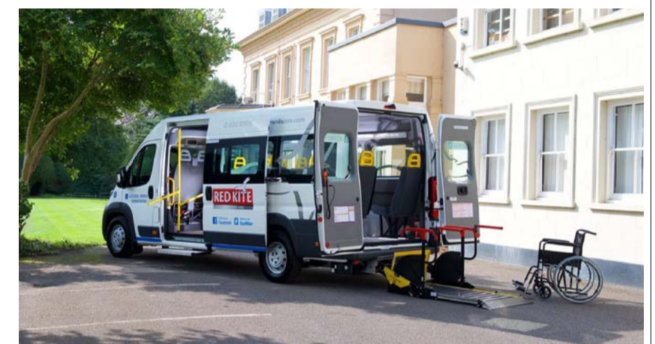
Example of drop off Vehicle - Peugeot minibus

DISCLAIMER: This drawings is based on CAD drawings from a third party, as such 3|10 Studio cannot guarantee its accuracy. Do not scale dimensions off drawings. Use written or calculated dimensions. The contractor is responsible for checking dimensions before ordering or starting work. This document contains confidential and proprietary information that cannot be reproduced or divulged, in whole or in part, without written authorisation from 3|10 studio Ltd. DRAWINGS NOT FOR CONSTRUCTION PURPOSES