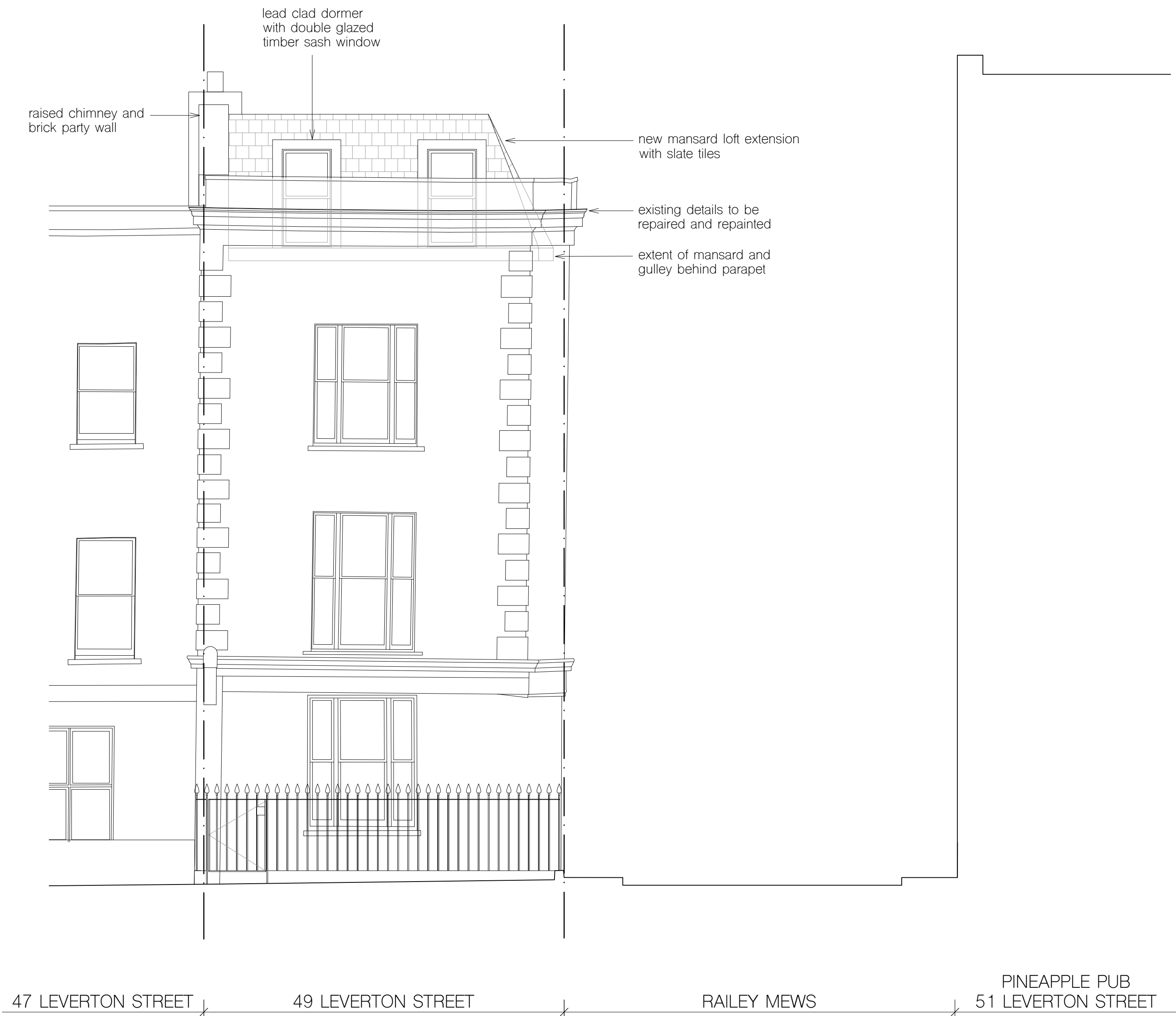
1 Proposed front elevation