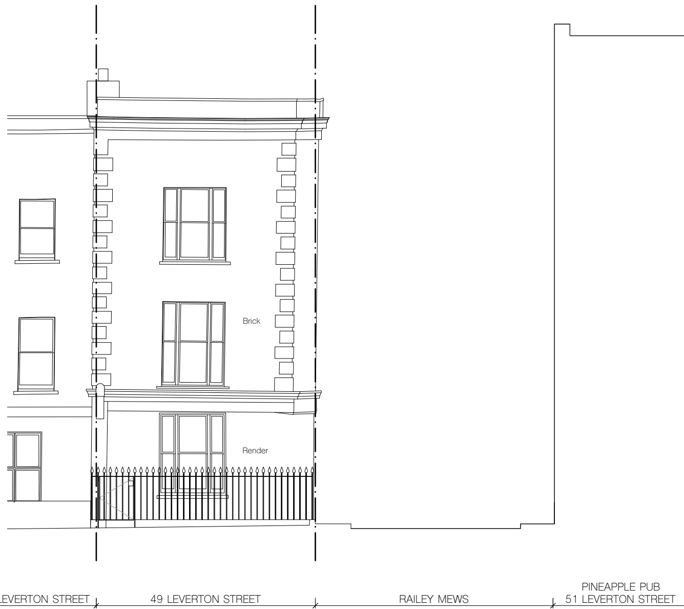
① Existing front elevation