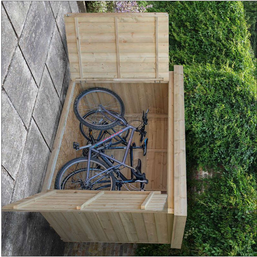
As Proposed Typical Covered Bike Store