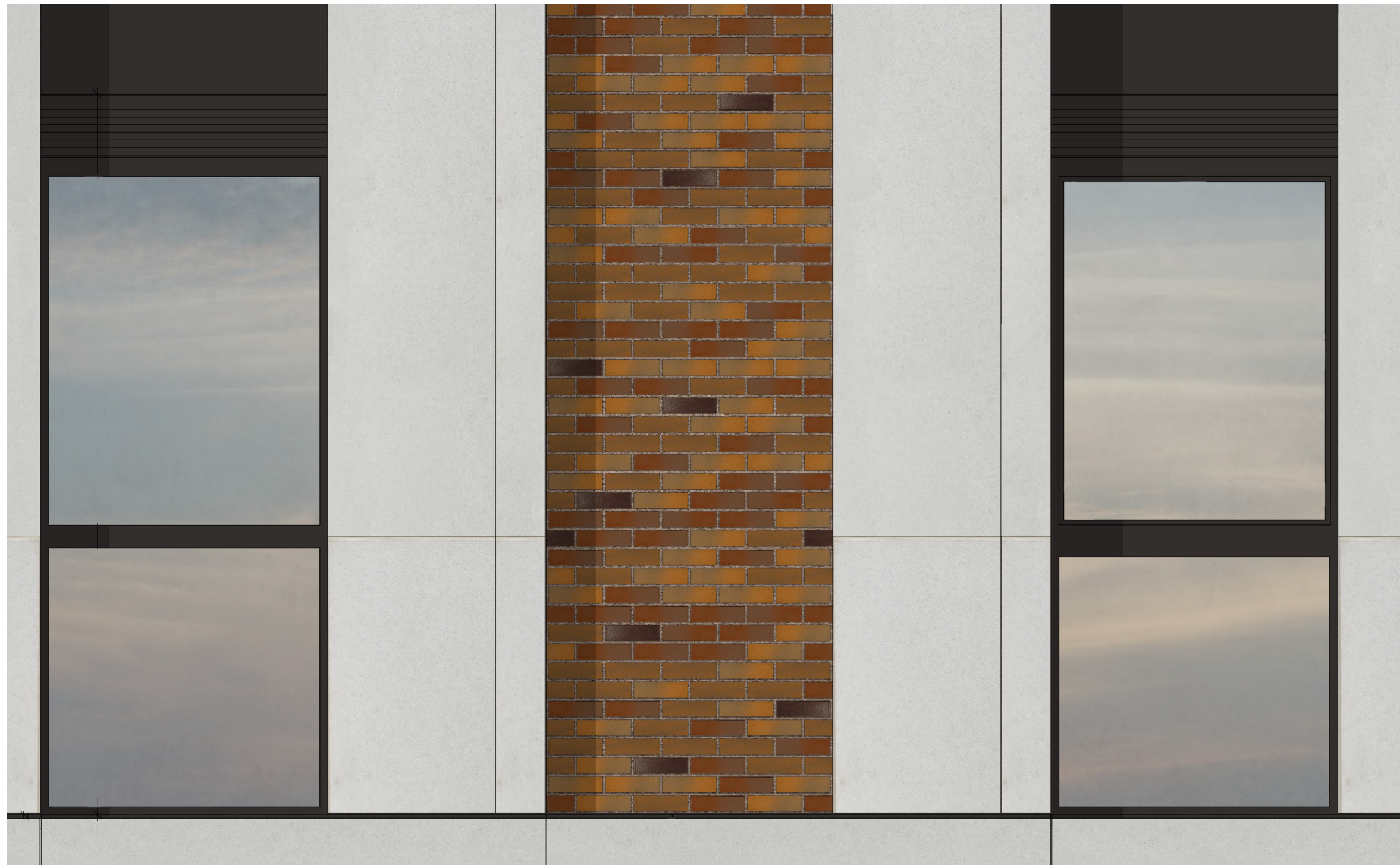
Single Story Bay Study