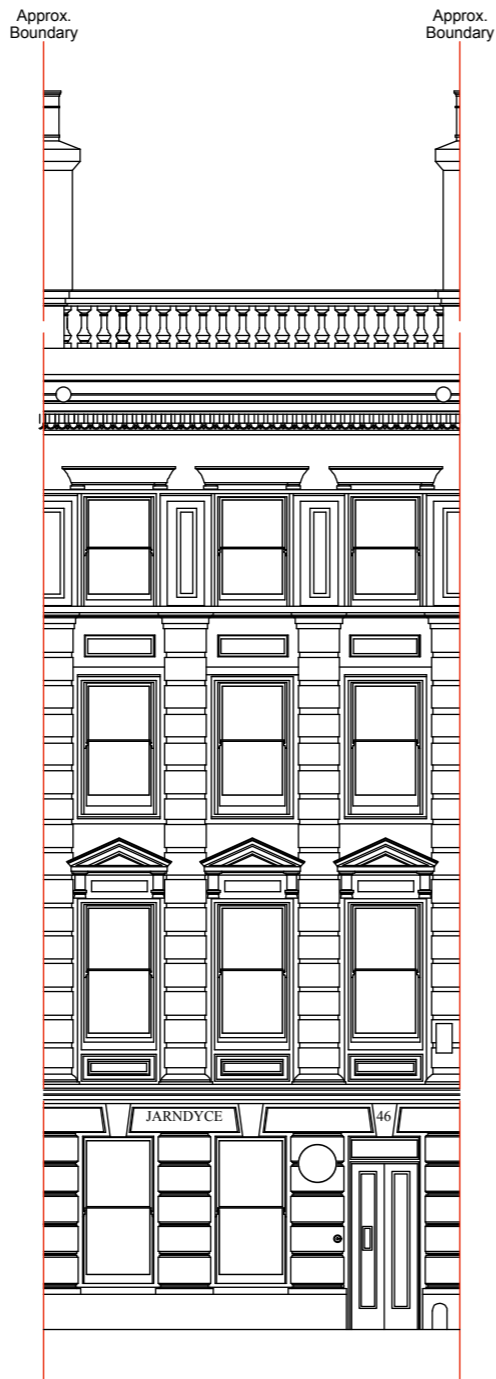
NORTH ELEVATION TO STREET