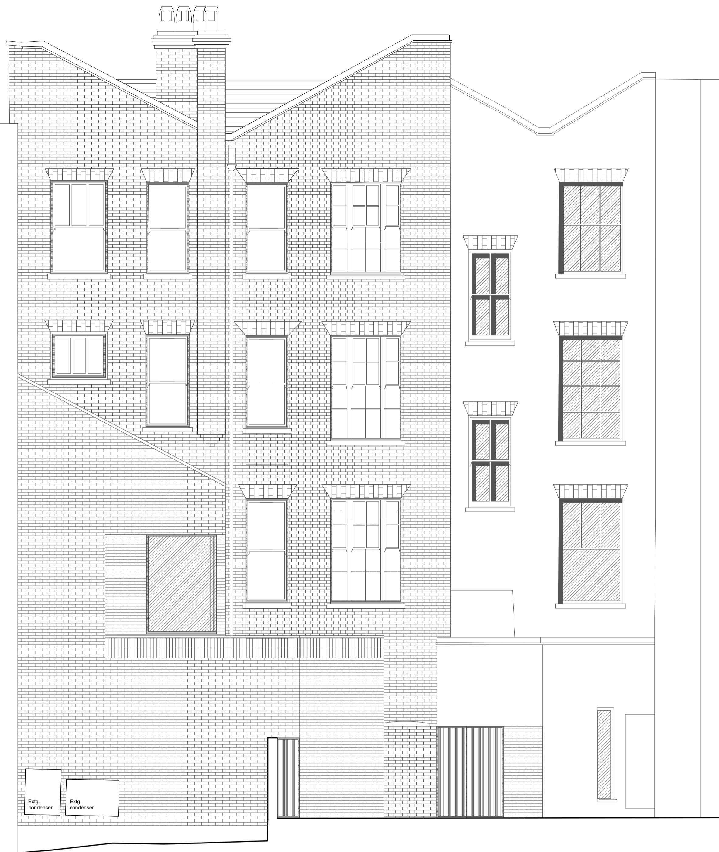
REAR ELEVATION B-B