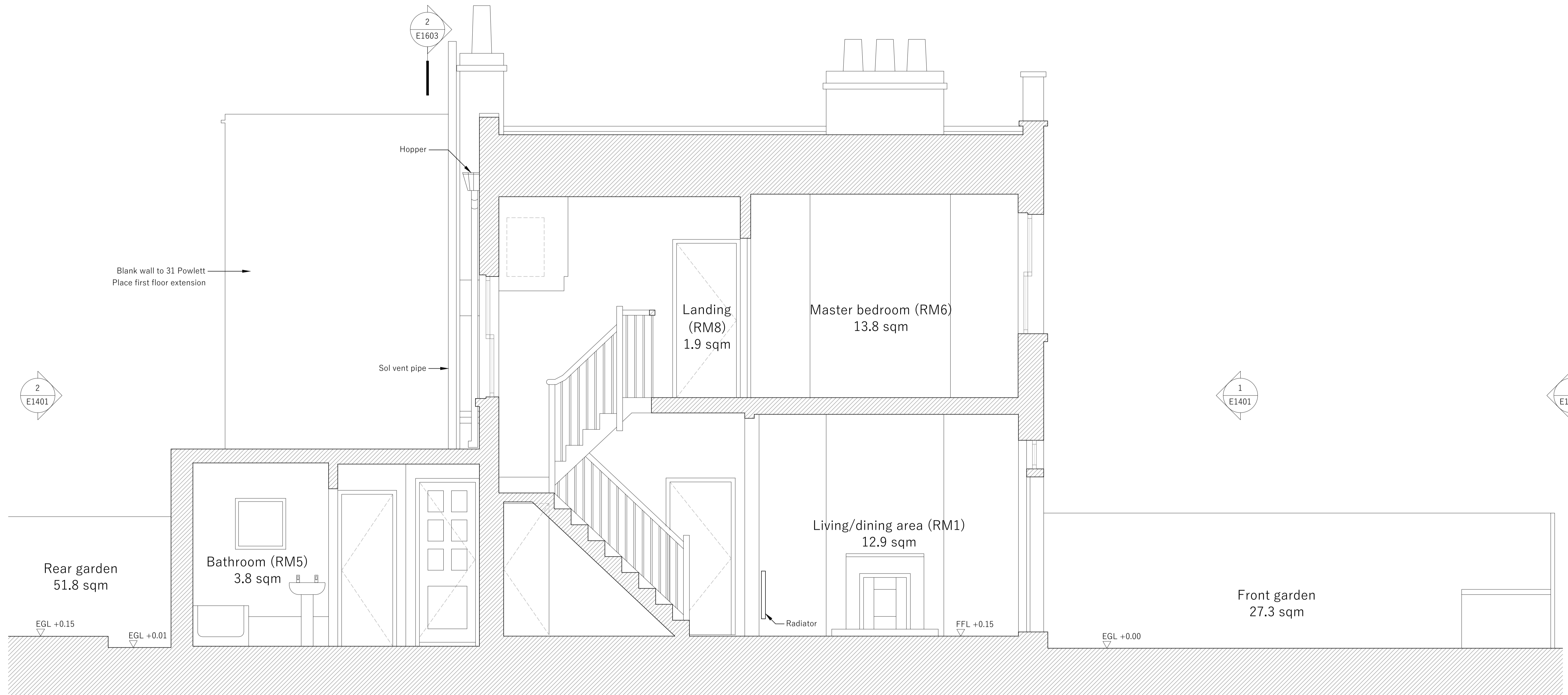
Long section looking East