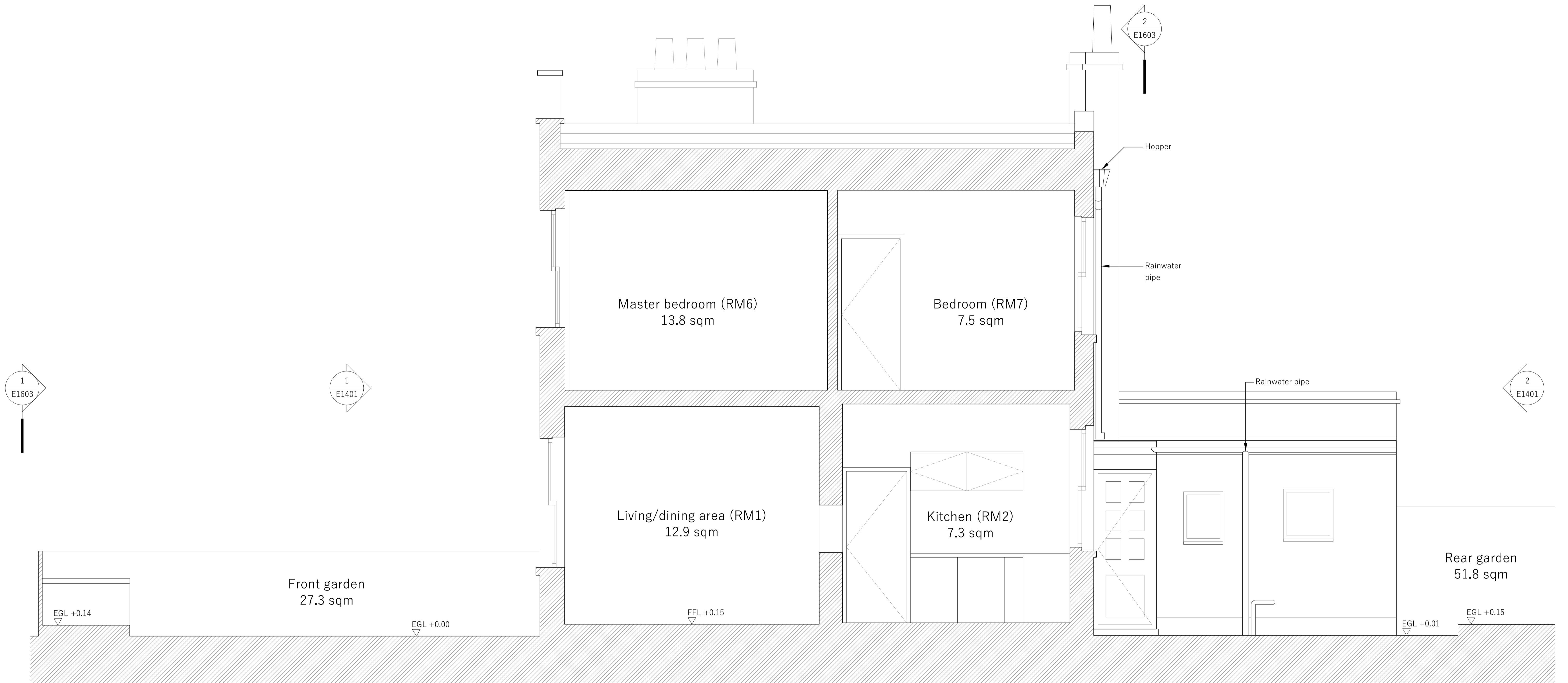
Long section looking West