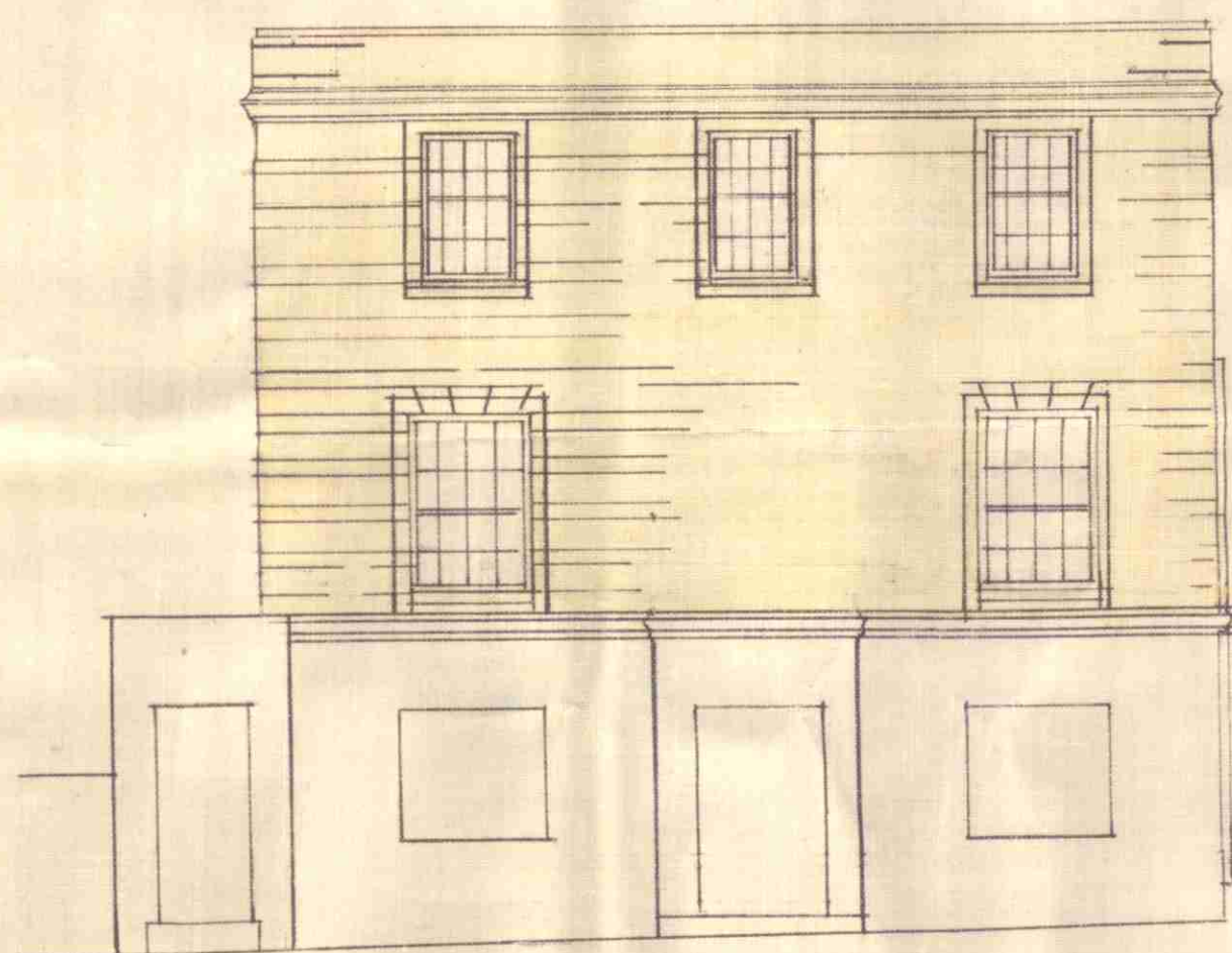
Elevation to ELSWORTHY RD.