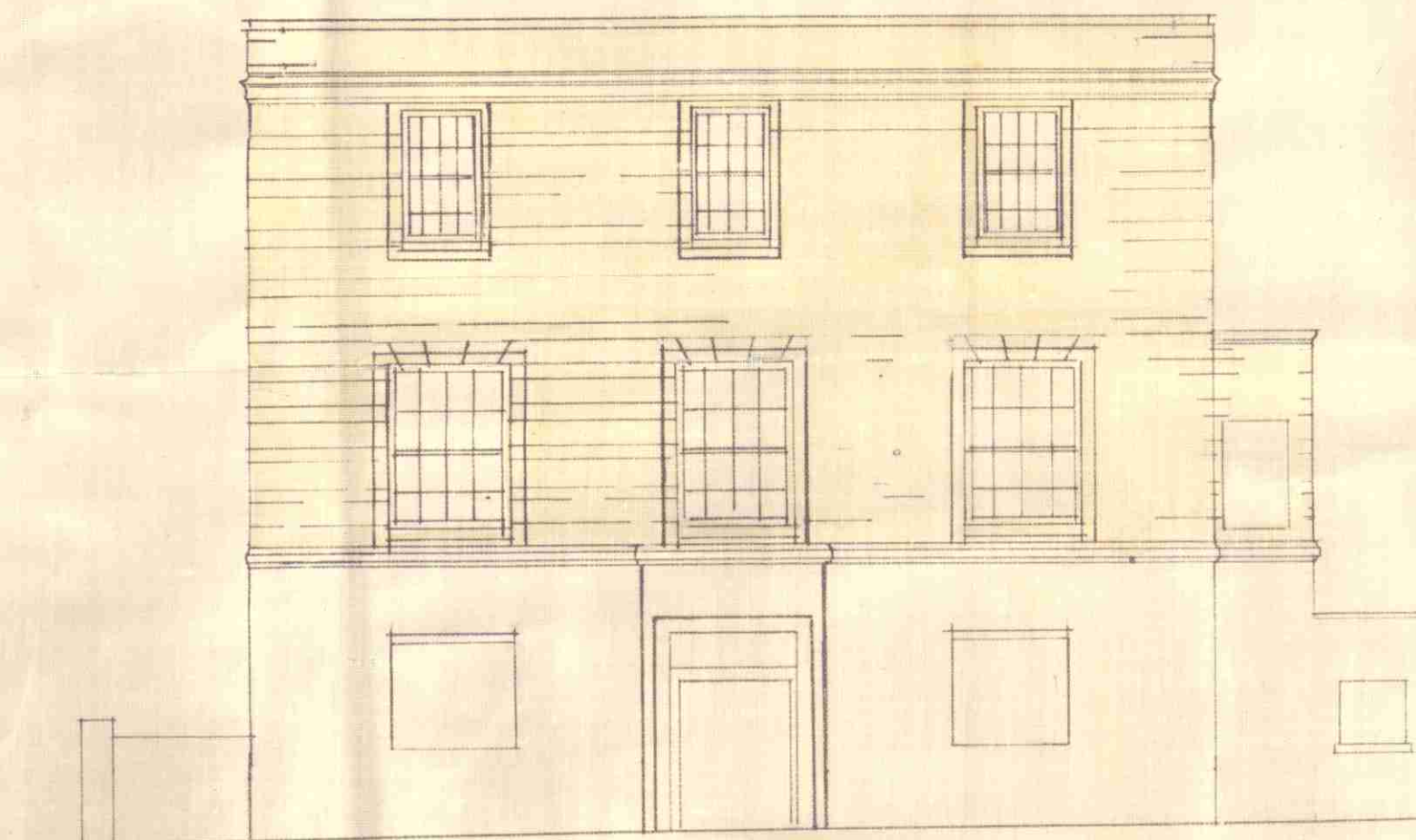
Elevation to ADELAIDE RD.

PRESENTED TO 29 JUL 1953 TOWN PLANNING COMMITTEE