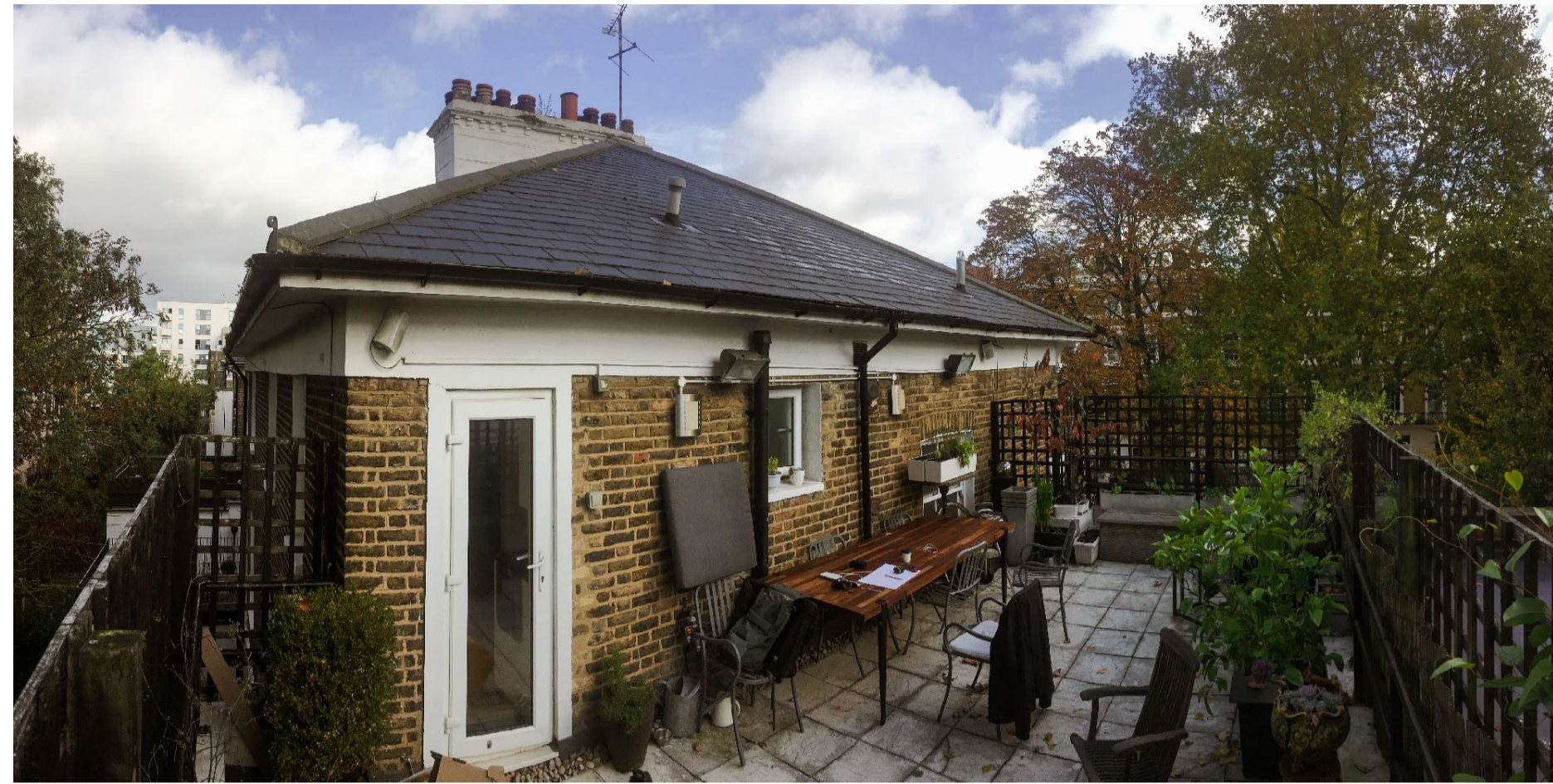
3 View of existing terrace to Flat 4