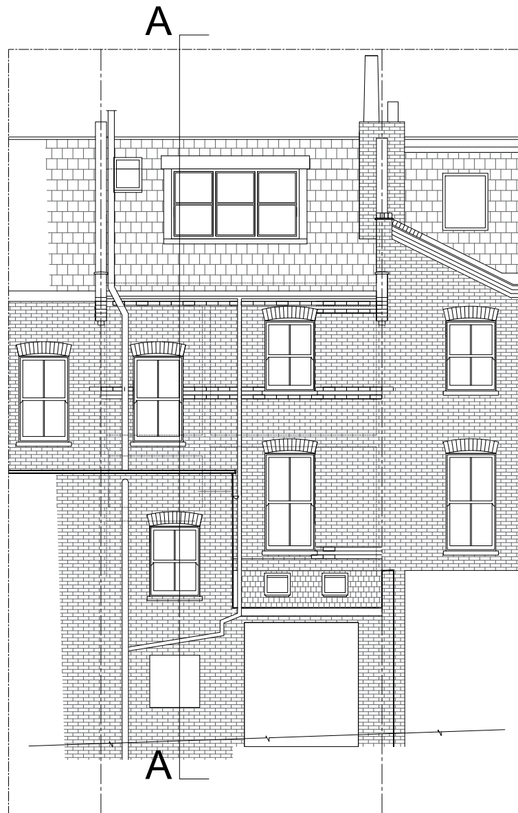
REAR ELEVATION as EXISTING.