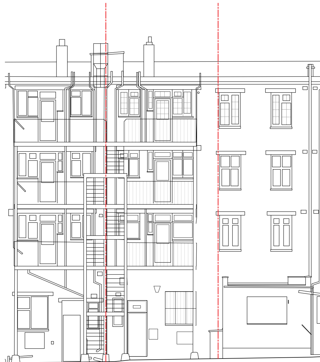
Existing Rear Elevation Scale 1:100