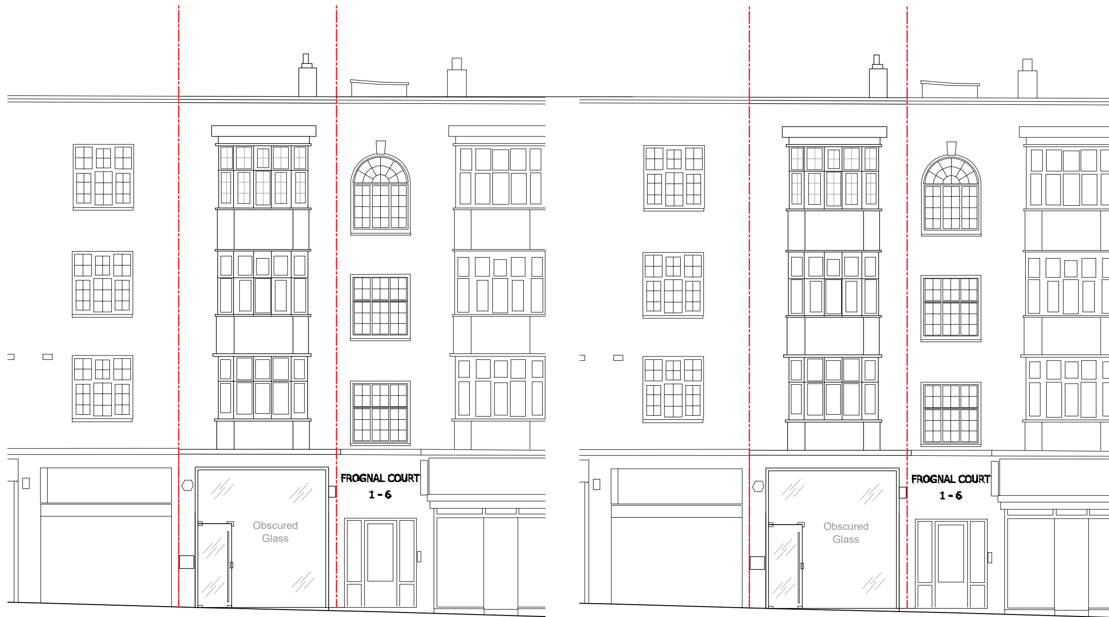
Existing Front Elevation Scale 1:100