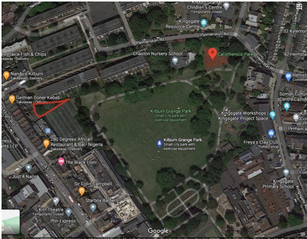
Ariel view of Kilburn Grange Park, with the rear garden area marked in a red.