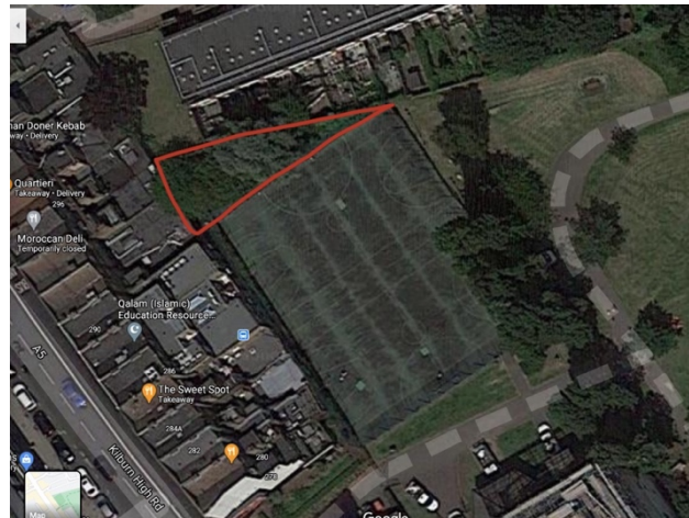
A close up ariel view of the landlocked area referred to in this management statement, found at the rear of 292 – 294 Kilburn High Road, NW6 2DB.