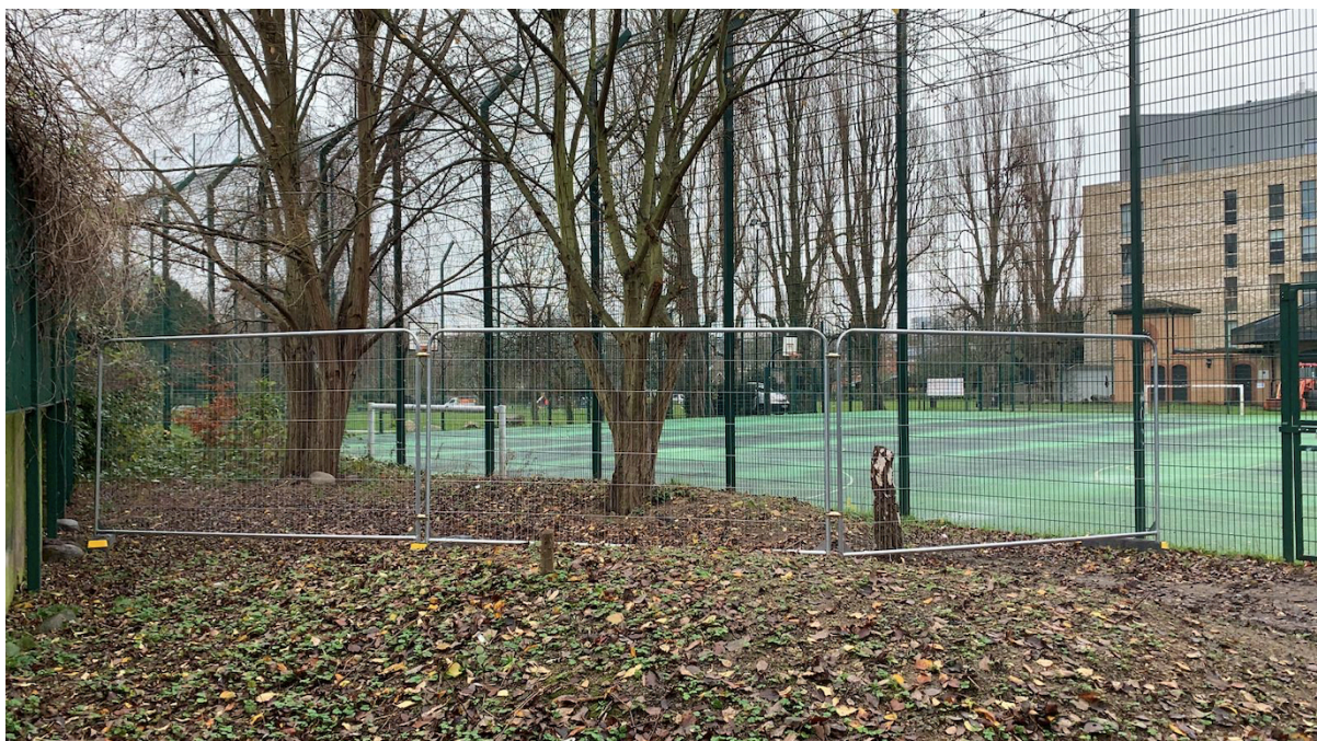
Image of rear end park space locked in between boundary and sports pitch

Our management team aims to give value to a space which appeared to be inaccessible to the public and not maintained. By maintaining this land we aim to affect the need and perception of our visitors in a positive light. If an area is of poor quality with no access, this may not meet the objectives of our local needs. Enhancing this area will most definitely drive up the quality of Kilburn Grange Park which already exists.