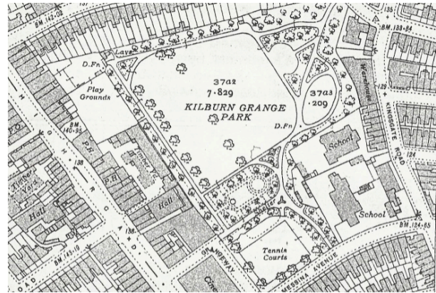
Kilburn and the Grange Park in 1935

Kilburn Grange Park serves as an important asset for our community, enjoying an open space otherwise referenced as 'Kilburn's Green Lung'. Qalam Education Resource Centre aspires to maintain and manage this particular area of the park, landlocked and located at the rear end of its premises on 292 – 294 Kilburn High Road, NW6 2DB.