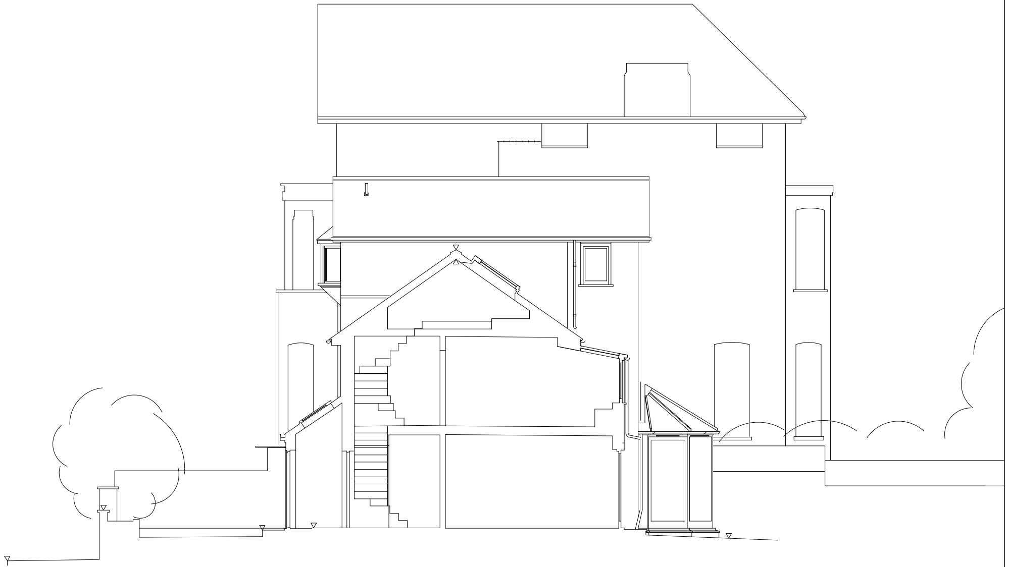
1 Existing Section Scale: 1:100