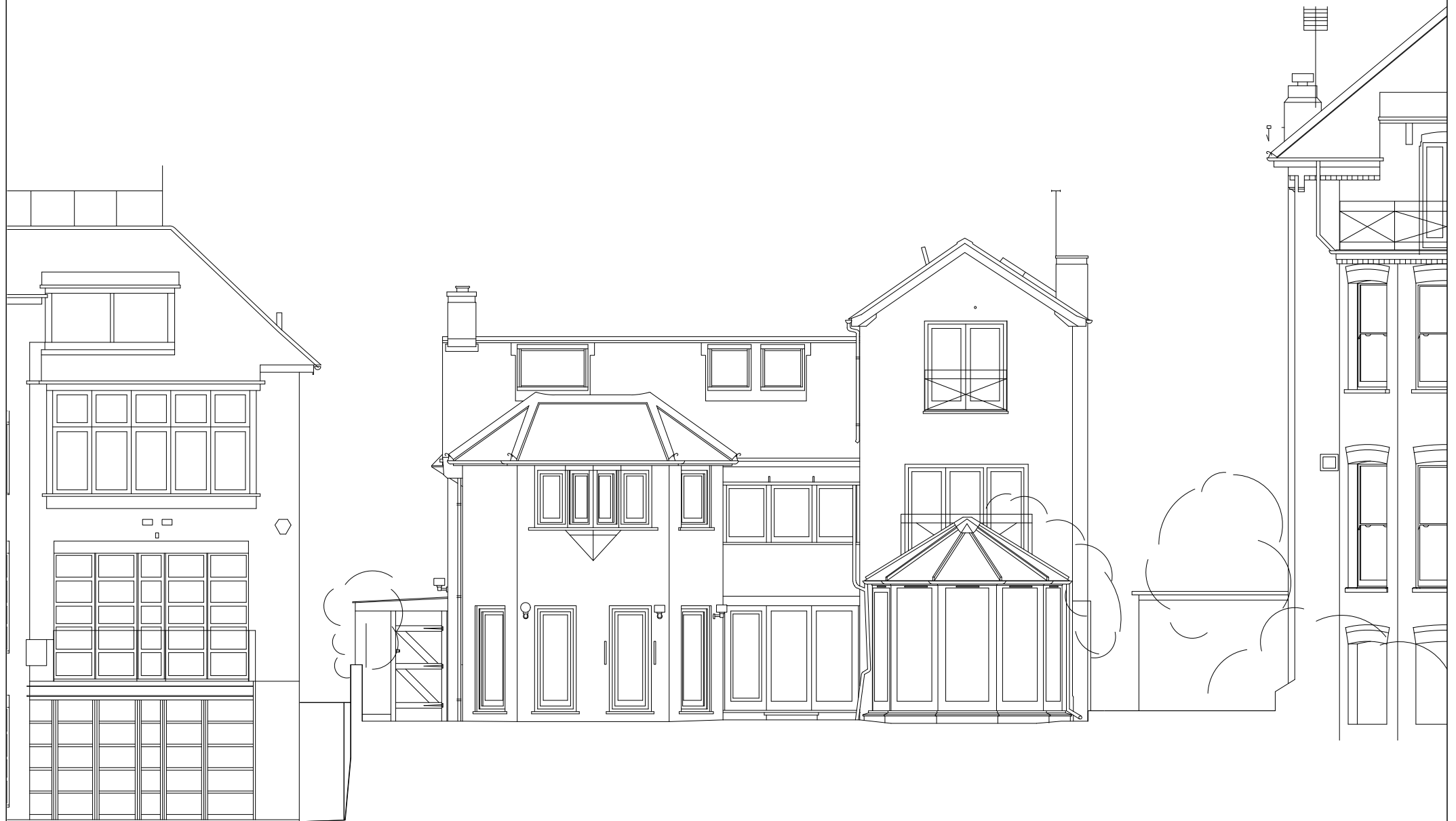
Existing Rear Elevation Scale: 1:100