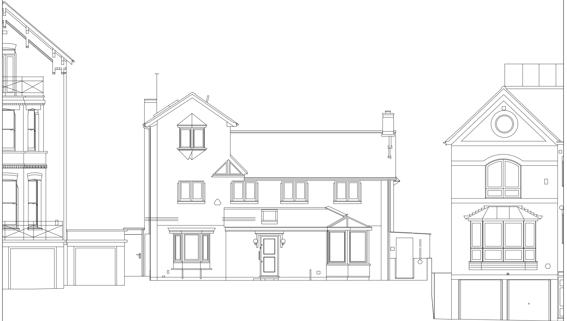
1 Existing Front Elevation Scale: 1:100