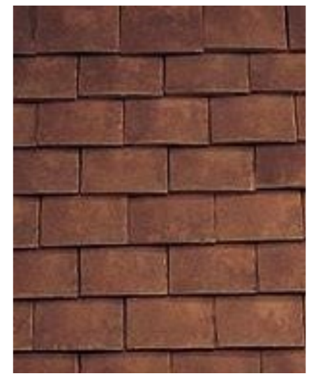
Example of new handmade Keymer Goxhill tiles