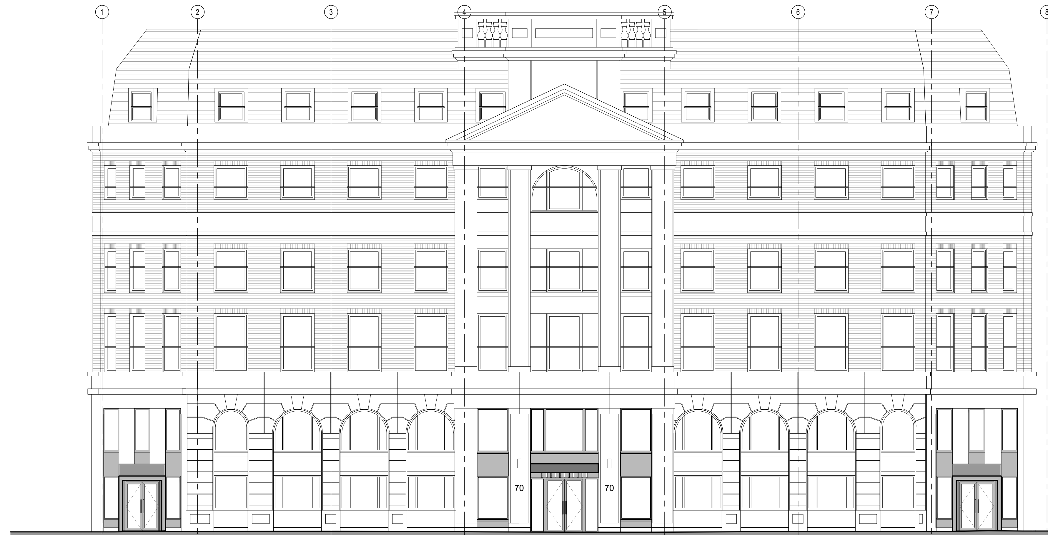
01 ELEVATION A: FRONT TO GRAYS INN ROAD SCALE: 1:100 (A1)