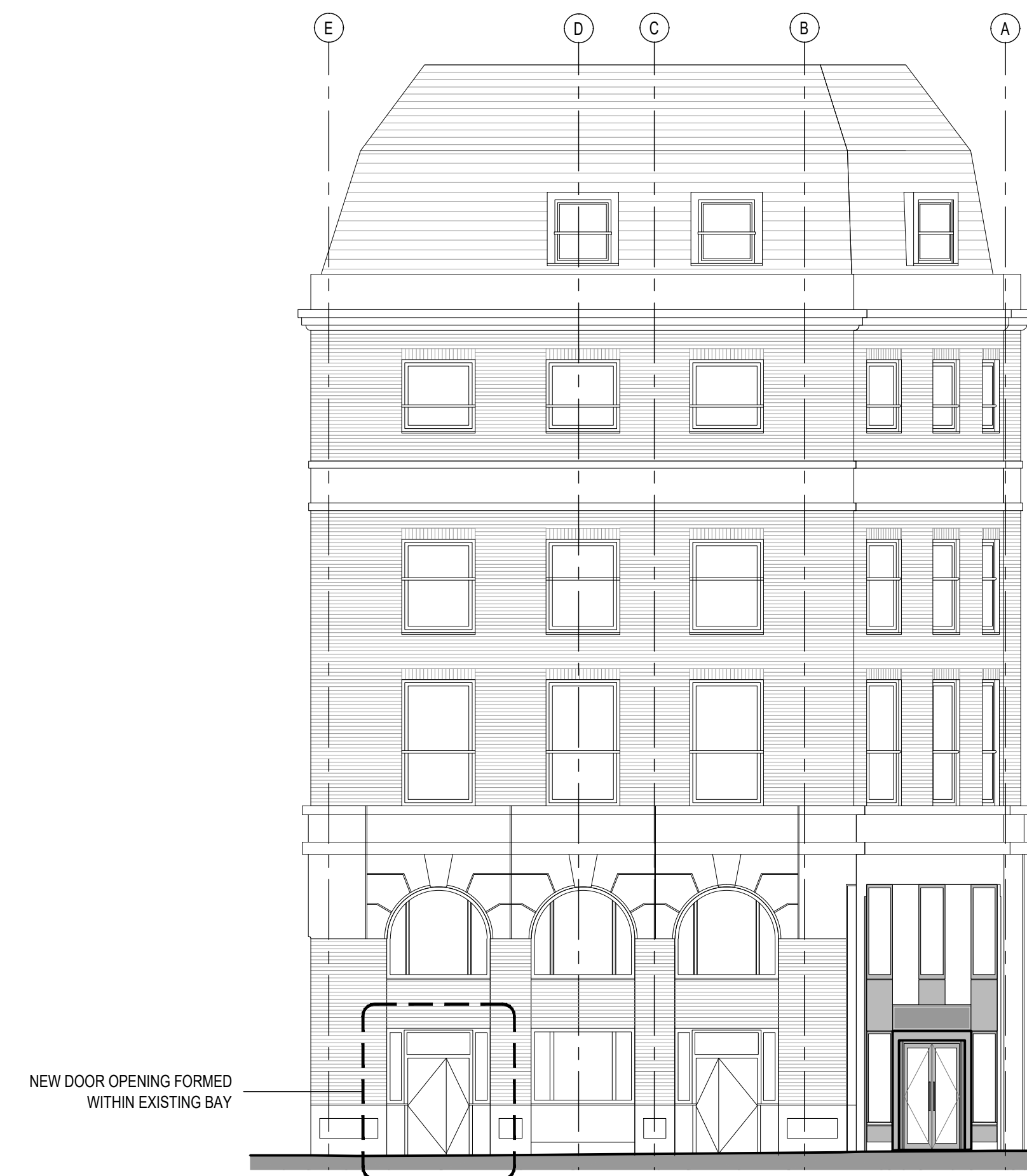
03 ELEVATION C: TO PORTPOOL LANE SCALE: 1:100 (A1)