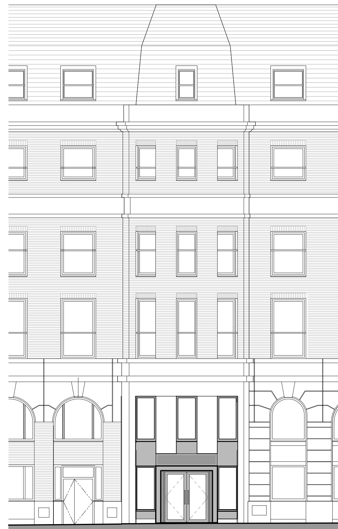
02 ELEVATION B SCALE: 1:100 (A1)