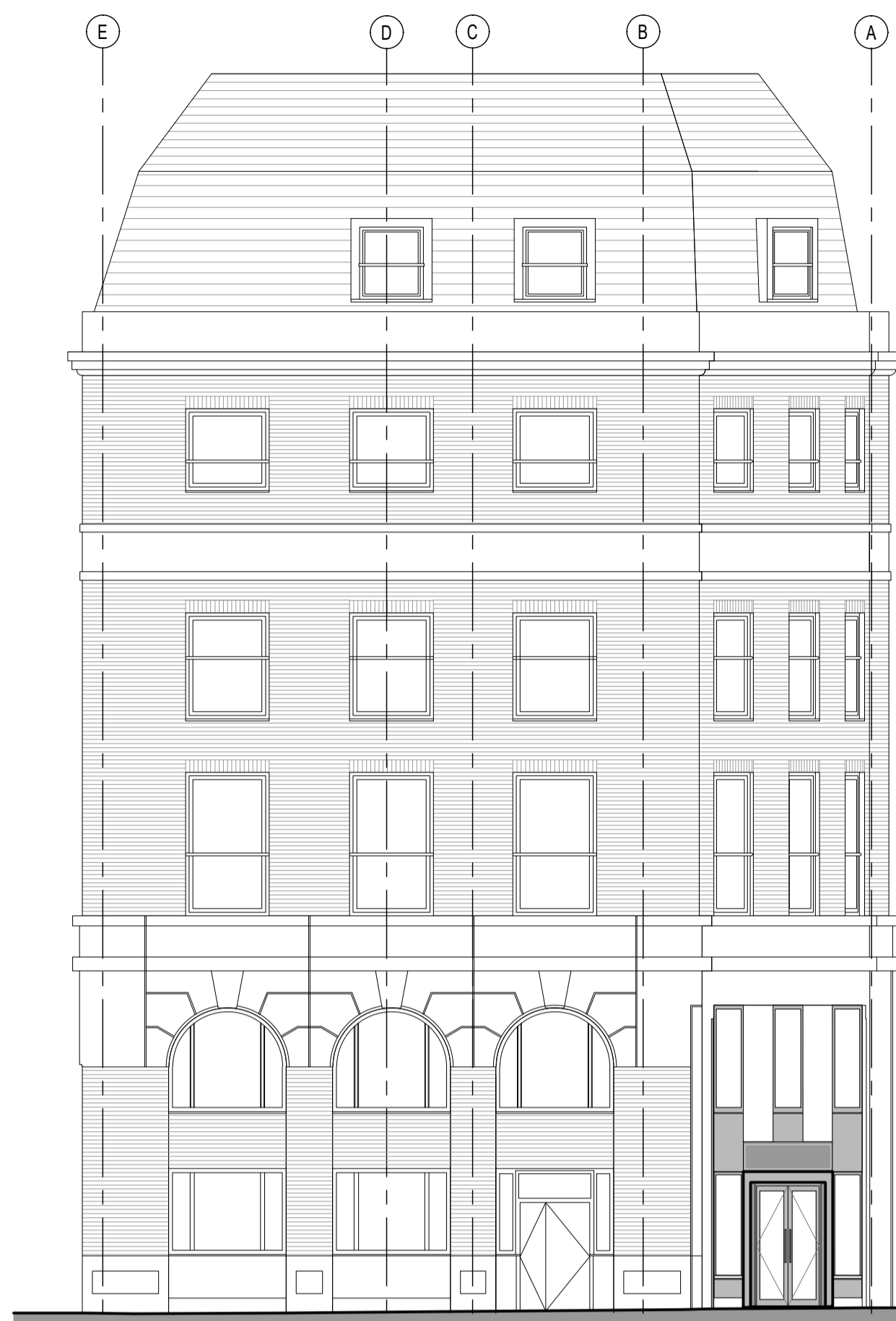
03 ELEVATION C: TO PORTPOOL LANE SCALE: 1:100 (A1)