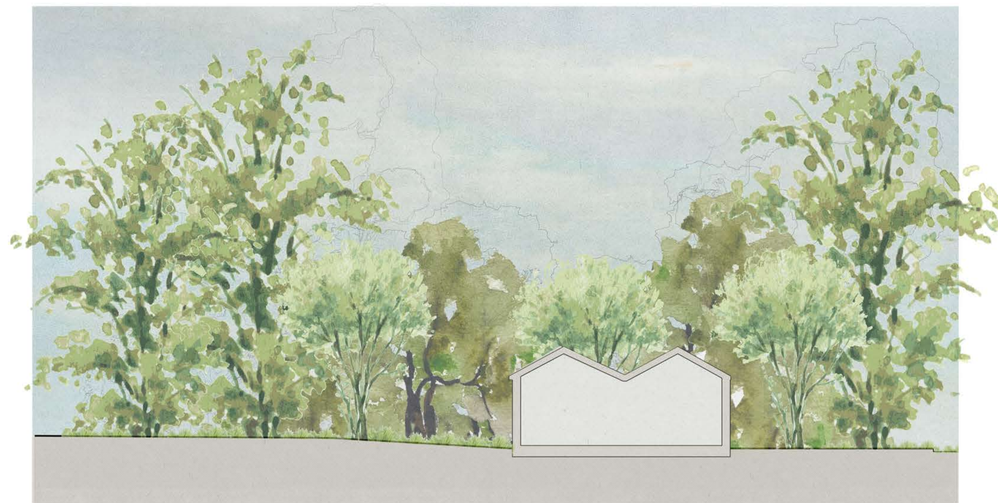
1 1:75@A1 SECTION