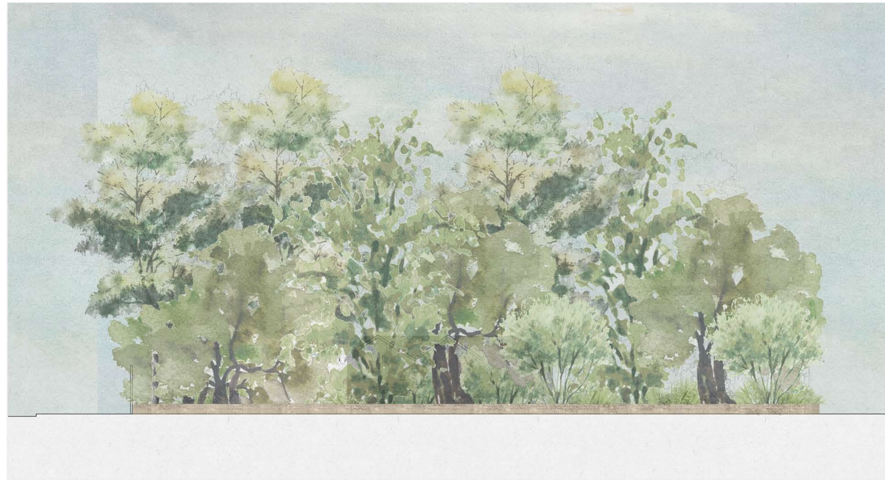
1 1:75@A1 ELEVATION