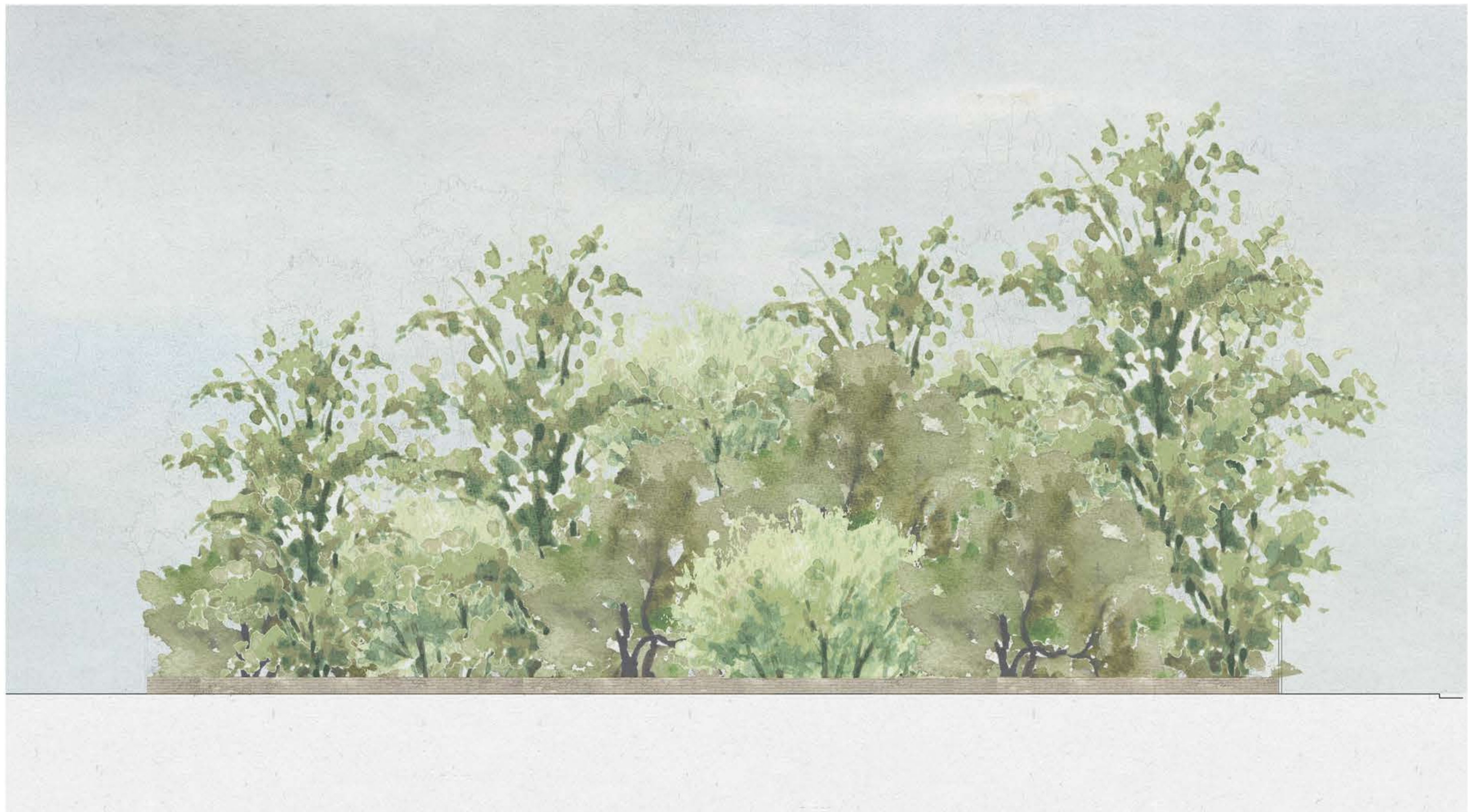
1 1:75@A1 ELEVATION FROM ACCESS ROAD