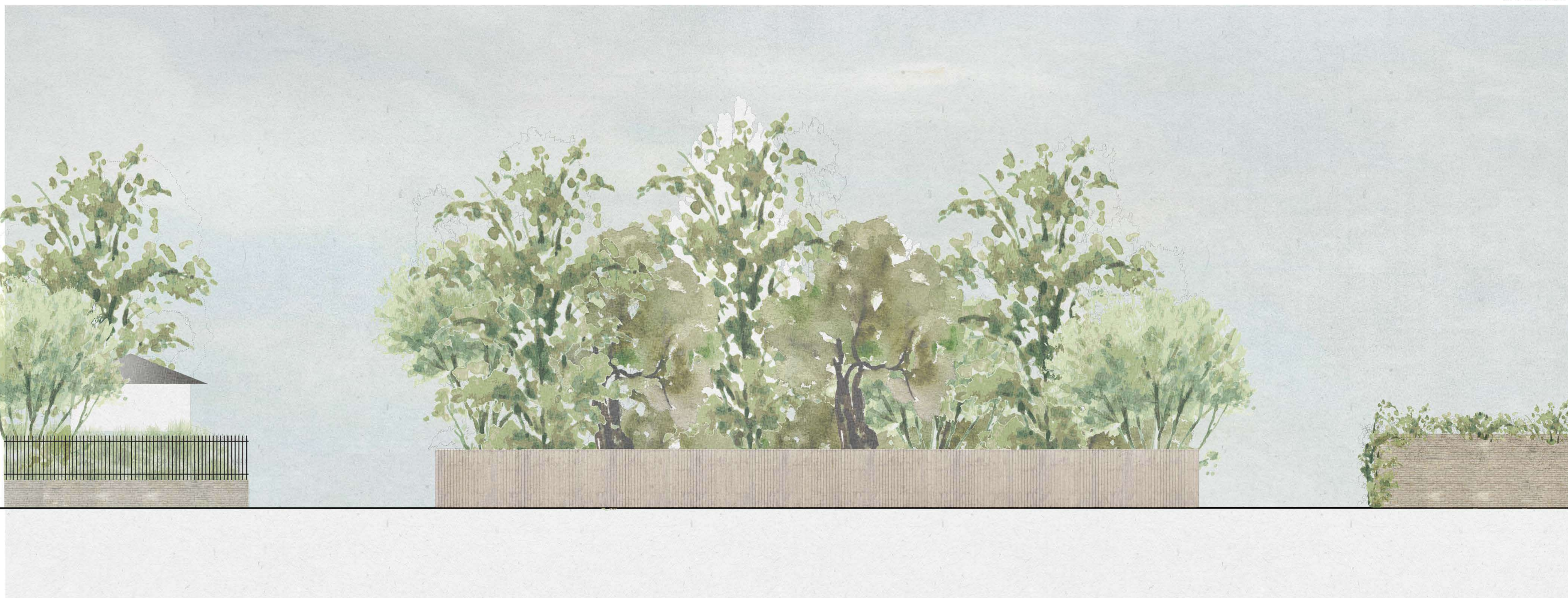
1 1:75@A1 ELEVATION FROM HIGHGATE WEST HILL STREET For illustrative purposes only