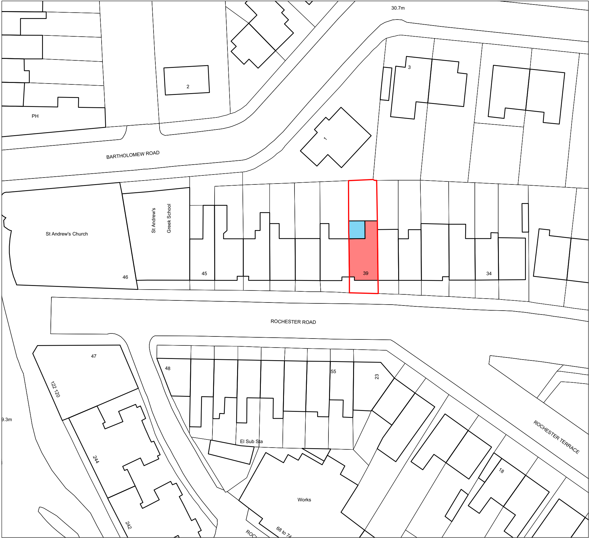
Site plan Scale 1:500