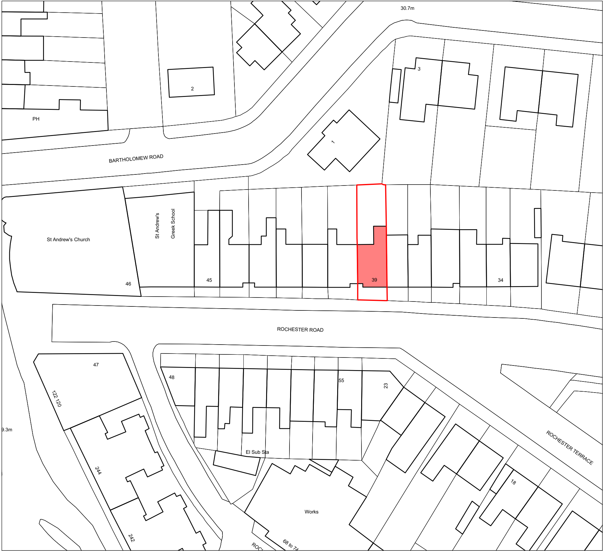
Site plan Scale 1:500 0 40 70 100 M