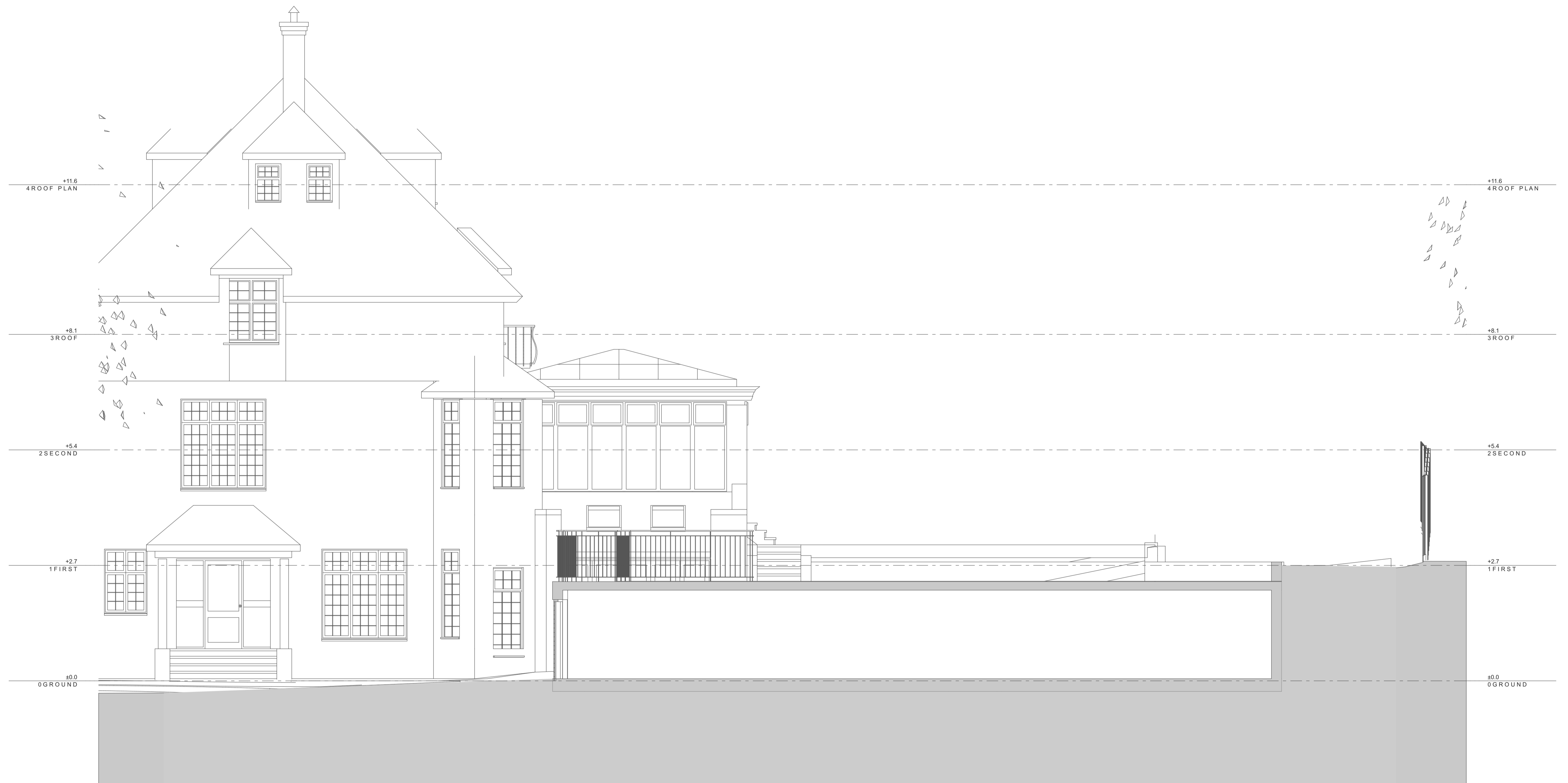
A LONG SECTION 1:50