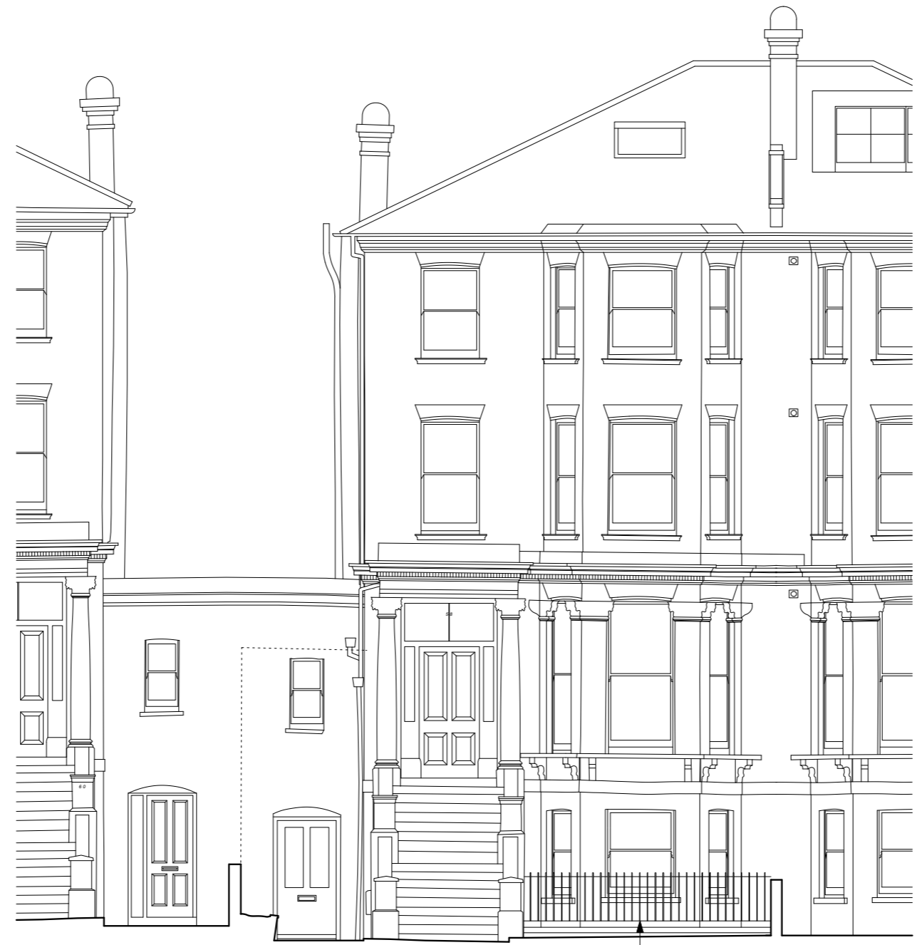
Proposed Front Elevation black painted metal balustrade (hidden behind hedge/planting)

72,000 71,000 70,000 69,000 68,000 67,000 66,000 65,000 64,000 63,000 62,000 61,000 60,000 59,000 58,000 57,000 56,000 55,000 54,000