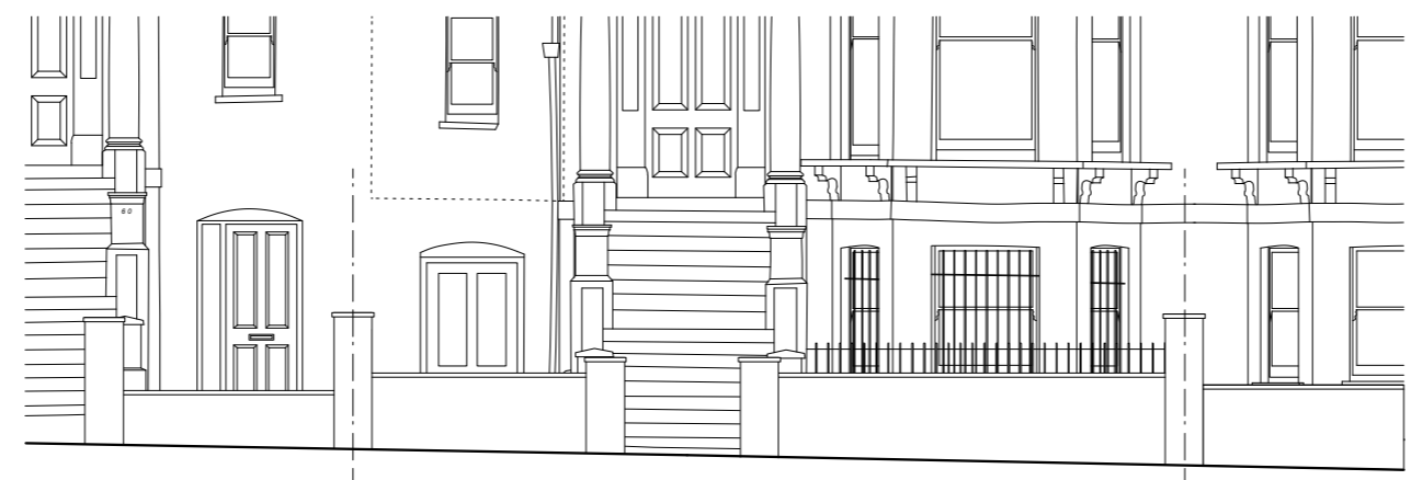
Proposed Boundary Wall Elevation (No Changes)