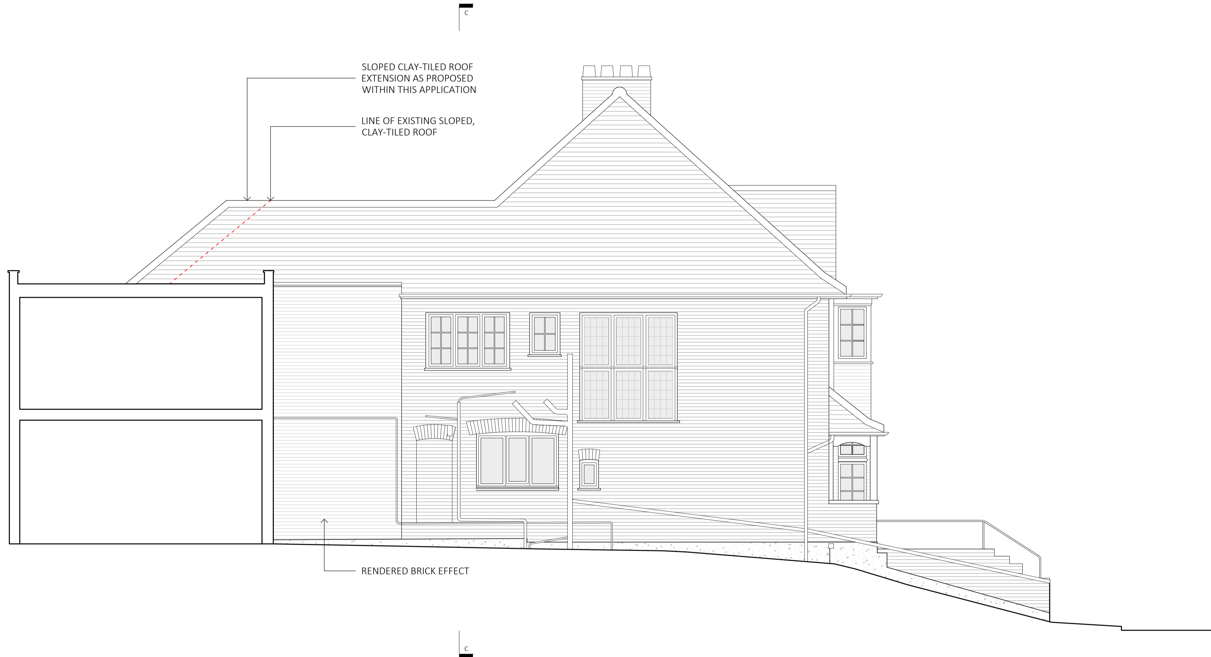
SECTION D - D