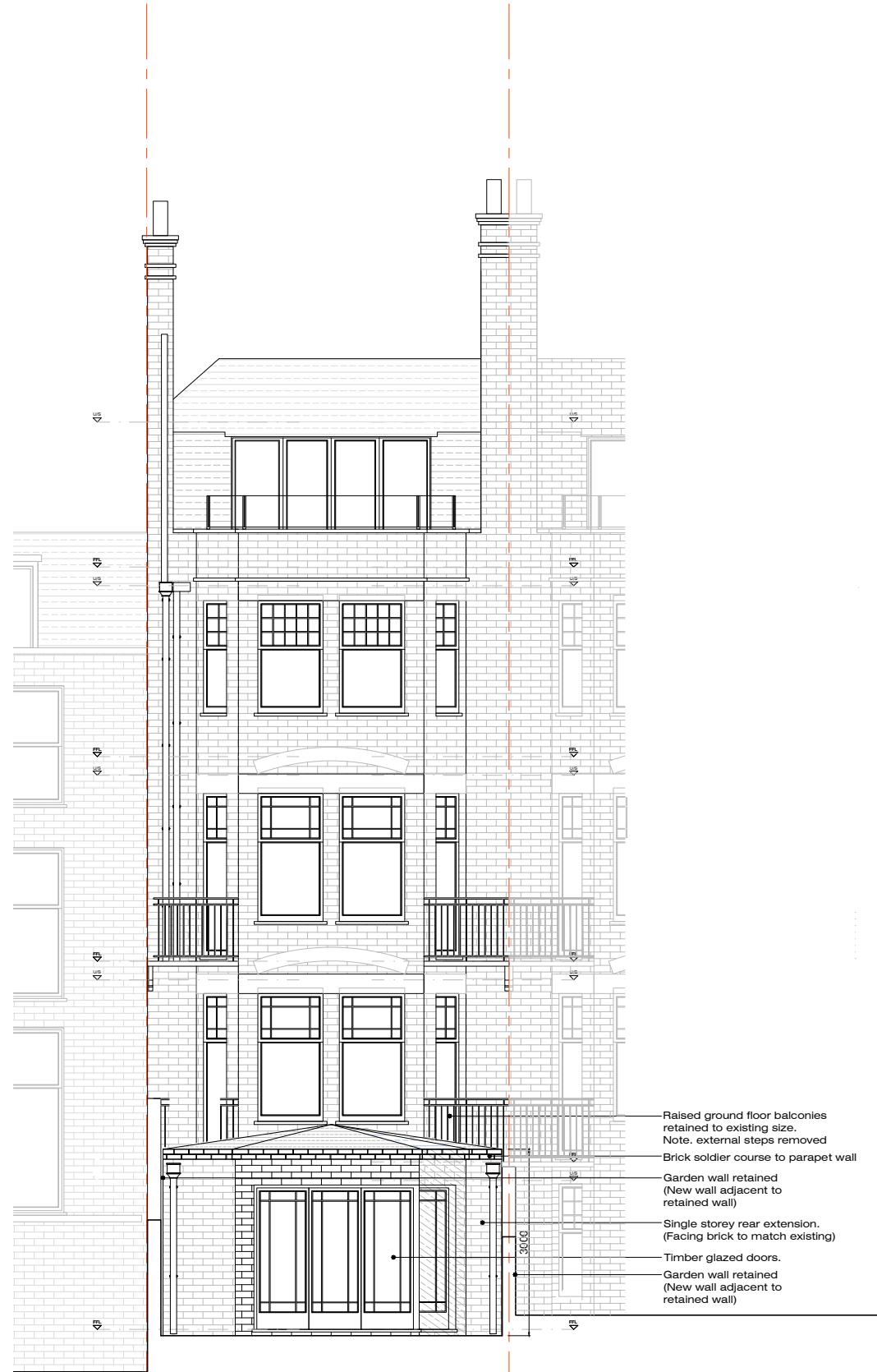
02 Proposed Rear Elevation 1:100 @A3