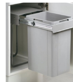
BIN BINOPOLIS WESCO BIO SINGLE COMPARTMENT 32L PULL-OUT BIN 757WS221-85: 300MM DOOR Product No. 757WS221-85