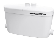
PUMP (saniflow.co.uk) SANIACCESS Pump