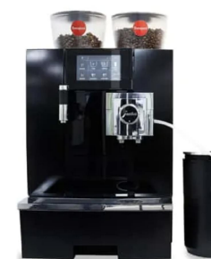
COFFEE MACHINE with MILK FRIDGE F3 Jura GIGA X - TBC Max Dimensions: 370 x 497 x 565 mm Power requirements: 240v 13a UK plug