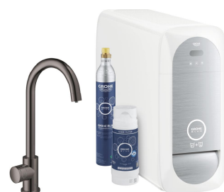
TAP (NOTE: ONLY FILTERED CHILLED WATER (STILL OR SPARKLING)) GROHE BLUE HOME MONO STARTER KIT Product Number 31498A01 EAN 4005176488979 Colour: hard graphite