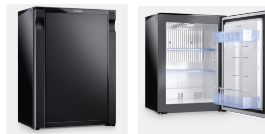
DOMETIC MINIBAR HIPRO 4000 - 34L 559H x W405 x 452Dmm. SKU number 9105705366 Net weight 13,5 kg Input voltage (AC) 210-220 V Rated input power (AC) 65 W.